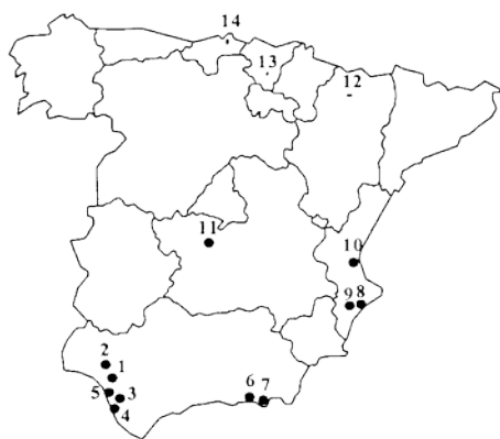
Fig. 1. Location of autonomous communities and wetlands where stiff-tails and marbled teal were collected in Spain. Wetlands 1 through 11, marked with circles, are within the range of the white-headed duck and marbled teal. Numbers of birds (L = white-headed duck, J = ruddy duck, H = hybrid, M = fully grown marbled teal, m = teal chick) collected at each wetland are as follows. Andalucía: 1 = Veta la Palma, Doñana, Sevilla, H (6), J (1), M (6); 2 = Lucio del Cangrejo Grande, Doñana, Sevilla, J (1); 3 = Laguna de Medina, Cádiz, J (1); 4 = Lagunas de Puerto Real, Cádiz, J (1); 5 = Laguna de Tarelo, Doñana, Cádiz, H (4), J (2); 6 = Albufera de Adra, Almería, H (2), J (1); 7 = Punta Entinas-Sabinar and nearby, Almería, J (3), H (2). Valencia: 8 = Santa Pola, Alicante M (4); 9 = El Hondo, Alicante, J (8), H (12), L (28), M (48), m (20); 10 = Albufera de Valencia, L (1), M (1), m (1). Castilla-la Mancha: 11 = Dehesa de Monreal, Toledo, H (1). Aragón: 12 = Laguna de Sariñera, Huesca, J (1). País Vasco: 13, Ullibarri-Gamboa, Álava, J (7). Cantabria: 14, Marisma de Santoña, J (1).

and consider how this relates to the rates of Pb-shot ingestion. We also investigate the levels of Pb found in newly hatched ducklings (not subjected directly to ingested Pb shot), an issue not previously studied in any waterfowl species.