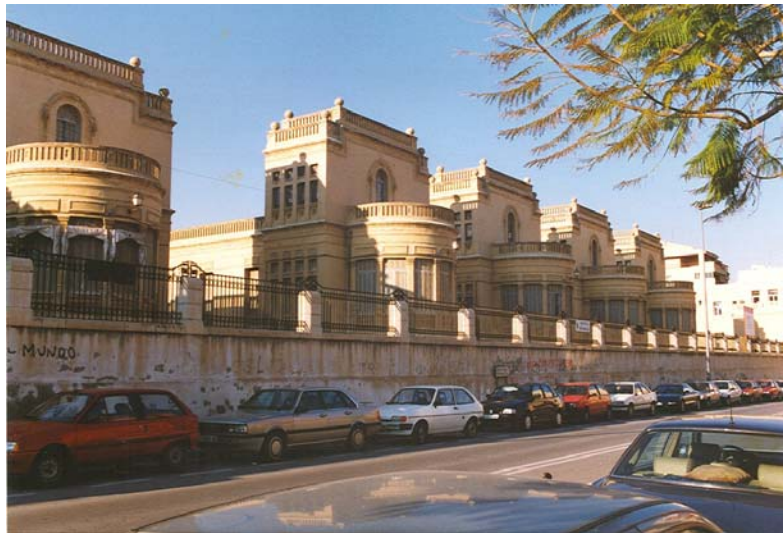
Figure 2 - Side view with the highest aspect of the building