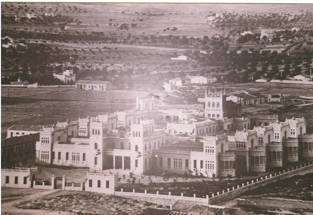
Figure 1 - Overall view of the Hospital buildings at the time they were completed