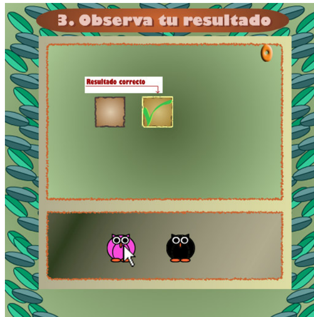
(Fig. 3. Third step. When an option is chosen, the result is showed. This result indicates if the answer is correct or not.)

This mini-game has all the characteristics that we include in our definition of conceptual mini-game for learning: It tries to teach or promote a specific concept, its rules are very easy to understand for users and it is endless, in the sense that there is no performance limit to be achieved by the user.