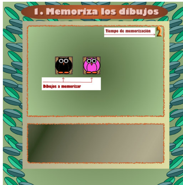
(Fig. 1. First step in the MemOwl game. Player has to memorize the pictures during a moment)