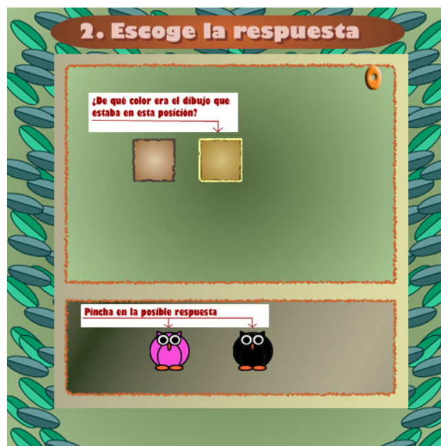
(Fig. 2. Second step. When time for memorizing finishes, pictures disappear and a square is pointed. The picture that was in the square has to be selected from alternatives below.)