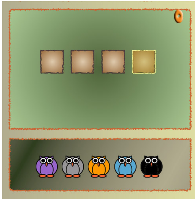
(Fig. 6. Higher level. The number of squares and pictures for memorizing are still increasing. The number of pictures for memorizing and for answering could be different)

MemOwl speeds up visual memory in the first place because players have to memorize the elements they see. Players have to pay attention to memorize and recognize these elements. Furthermore, MemOwl stimulates the short-term memory because this game consists in consecutive memorizing exercises so things which were memorized in a previous stage will be replaced with the next ones. In short, the type of memory which gets more exercised in this conceptual mini-game is the photographic memory. Players have to memorize visual elements in a short period of time. When players achieve higher levels, the period of time for memorizing decreases, so they have to use their photographic memory for solving the situation.