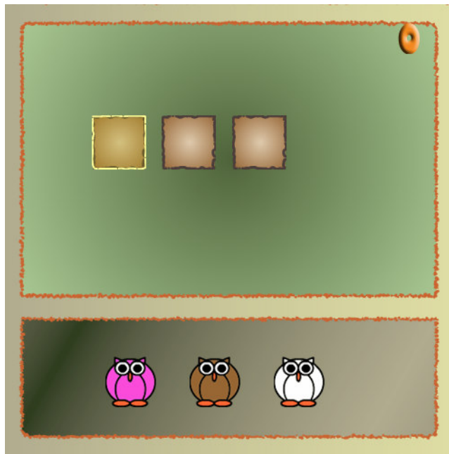
(Fig. 5. Medium level. The number of squares and the number of alternatives for picking up an answer are increasing. The number of pictures for memorizing and alternatives for answering could be different)