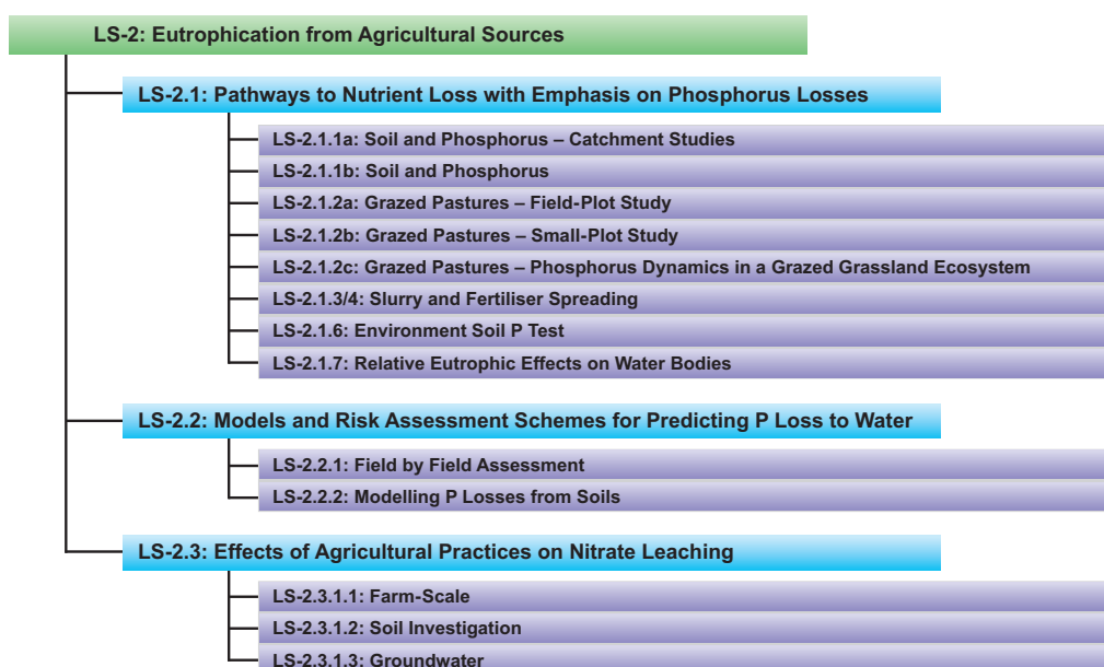
Figure 1: Overview of the project LS-2: Eutrophication from Agricultural Sources

Integrated synthesis reports for the LS-2.1, LS-2.2 and LS-2.3 main projects and the reports from each of the individual projects are available for download on the EPA website at http://www.epa.ie/ .