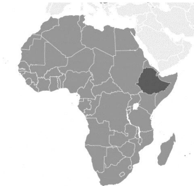
Figure 1: Map showing Ethiopia's geografic setting in Africa (GreenwichMeanTime 2012)

While these investments provide hope for rural development they also highly involve asymmetries in economic assets, political power and social structures. Even though the task of safeguarding the rural poor are at least theoretically held as important for the state and such demands are put upon investors, the gap between the decision making power, agro-industries and the average farmer is hard to bridge on the ground. The problem this study aims to address thus relates to the risks these large-scale land investments bring to the rural communities and the complexity of safeguarding them.