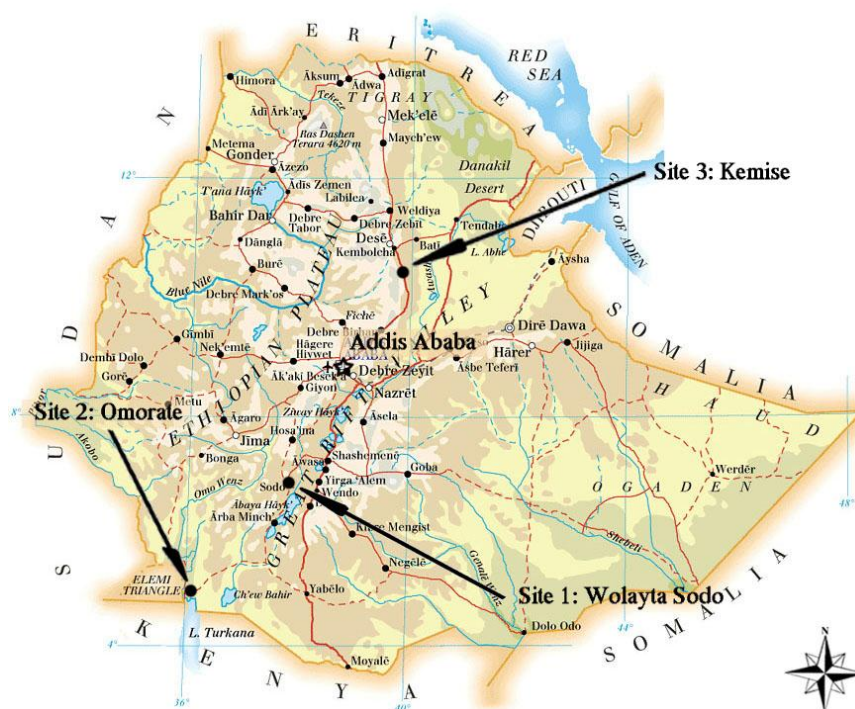
Figure 2: Map over Ethiopia showing the study sites and the capital (Vidiani 2012)

The study focuses on three different land investments for biofuel production, geographically spread in the Southern Nations, Nationalities and Peoples' Regional State (SNNPRS) and the Amhara Region selected from a nation-wide biofuel survey, conducted by the Ethiopian Development and Research Institute (EDRI) in 2010. The case studies are based on interviews and observations with stakeholders during an eight-week field study in Ethiopia. Two foreign and one domestic company were studied, engaged in two significantly different out-grower schemes and one plantation, their geographic setting pointed out in Figure 2 , below.