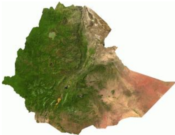
Figure 3: Satellite image over Ethiopia (The Encyclopedia of Earth 2012)

The main export products are coffee, vegetable oil plants, chat, gold and leather goods (Sida 2012). The annual growth rate of the Ethiopian economy has been stable at around 11 percent the last five years, although high this increase is marginal if considered in relation to the population increase. The annual inflation rate was in 2011 recorded at is highest, at 40 percent and has since then dropped 20.9 (latest update July 2012). (Reuters Africa 2012)