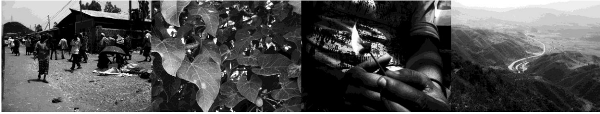
Figure 8: From left to right showing: Kemise town, the jatropha plant, burning jatropha seed, the hills of South Wollo. Pictures taken in Kemise by authors, 2012