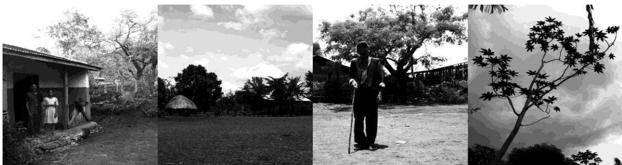
Figure 6: From left to right showing: farming household, farmer's house, aged farmer, castor bean plant. Pictures taken in Wolayta Sodo, by authors 2012

The majority of the inhabitants of this area are small-scale farmers holding on average half a hectare of land per household, mainly cultivating maize, sweet potato, enset (false banana), teff (endemic grain), haricot bean, sorghum, Irish potato, yam and cassava (Interview A1; SNNPRS 2012a:17-18). The majority of the farmers also hold livestock, predominantly cattle, sheep, goats, donkeys and poultry, and the main cash crop produced is coffee. The administrative center of the zone, Sodo, is one of few towns in the region with an adequate infrastructure; asphalt roads, electric power and telecommunications, piped water supply, as well as banking, health facilities and one of the country's biggest university. It is located along the main road leading south from Addis Ababa, roughly six hours away on public transport and a three hour journey from the regional capital, Awassa. (SNNPRS 2012a:17-18)