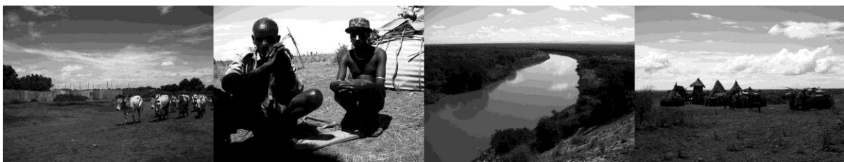
Figure 7: From left to right showing: cattle, Dessanesh pastoralists, the Omo River, a pastoralist kebele. Pictures taken in Omorate by authors, 2012

Recently, the Ethiopian government has taken initiative to develop the infrastructure in the area, to promote investments and agricultural production and to strengthen the health and educational status of the region. In Omorate, both the government and NGOs are involved with projects aiming at securing access to food for both the community members and their cattle during the harder times of the year. These projects all involve agricultural activities which, deliberately or not, inevitably result in a higher degree of stationary settlement for the pastoralists. An accelerated cultural tourism in the area has also increased the contact between the tribes and the ‘modern world’ (Briggs 2009:538-539, Interview B2)