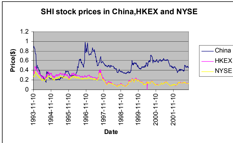
Sinopec Shanghai Petrochemical Co.Ltd stock prices in China, Hong Kong, and New York

It means the time series of share prices could not be expected to have a constant mean and variance over time, in other words they have unit root and are nonstationary. The exception: JCC, SHI, YZC on China market, ZNH on HKEX, ACH and CEA on HKEX and NYSE are stationary at 5% significance level during the tested period, but all 14 stocks are nonstationary at 1% significance level during the tested period. One reasonable explanation for their stationary is their thinly trading volumes and low stock prices.