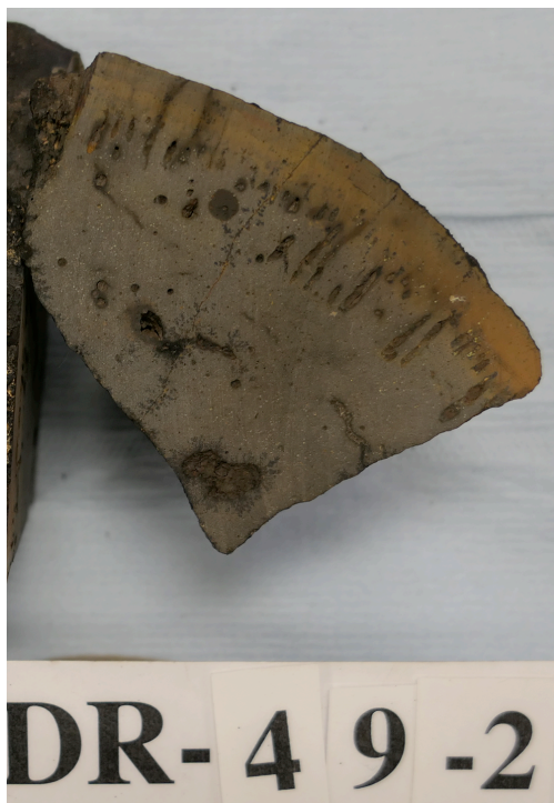
Pillow lava fragment with chilled margin (yellowish rim) and elongated pipe vesicles which were trapped when their ascent through the still molten interior of the pillow stopped at the already solidified margin rim.

In the middle of the week we started our long transit to the next working area, the Ojin Rise seamount province. The transit was conducted in two legs: The first leg led us 200 nm (about 370 km) to the south to the northernmost representatives of the broad belt of Ojin seamounts. We managed to get volcanic rocks from two out of three sampled structures. One dredge haul recovered a large amount (the chain bag was half full!) of relatively well-preserved pillow lava. Their characteristic pillow-shaped form and radiating shrinkage cracks are attributed to the extrusion of lava under water, which causes rapid cooling and formation of a skin ("chilled margin"). Outgassing volatiles escape outwards from the still molten interior of the pillow, and form elongated pipe vesicles (photo). The rapid quenching of the skin leaves no time for crystal growth (upon cooling and solidifying) so that the chilled margin is originally made of volcanic glass. Getting fresh (unaltered) volcanic glass is highly desired because it allows a number of geochemical applications. However, glass does not age very well, particular after contact with seawater, and therefore we did not expect to find fresh glass in our millions of years old volcanic rock samples.