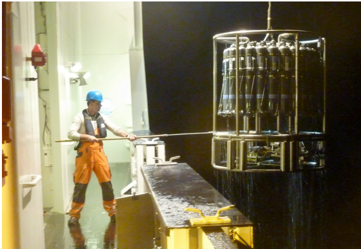
Retrieving the CTD probe at night time.

During the second week of the R/V SONNE cruise SO265 everyone on board became accustomed to the constant alternation between searching for new sampling sites (i.e. mapping of the seafloor) and sampling (dredging). Furthermore, the sample preparation in the labs became routine.