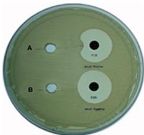
Figure 2. Modified three-dimensional test showing AmpC positive (A) and negative (B) results

A known AmpC-positive isolate of Klebsiella pneumoniae was used as control reference strain (Figure 2).