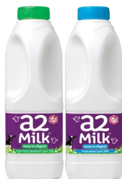
Figure 2: A2 milk products on the market (Internet1)

In August 2003, ‘The a2 Milk Company’ exclusively licensed patent and trademark rights to US-based Ideasphere Incorporated (ISI) to market a2 Milk products in North America (A2 Corporation, 2004).