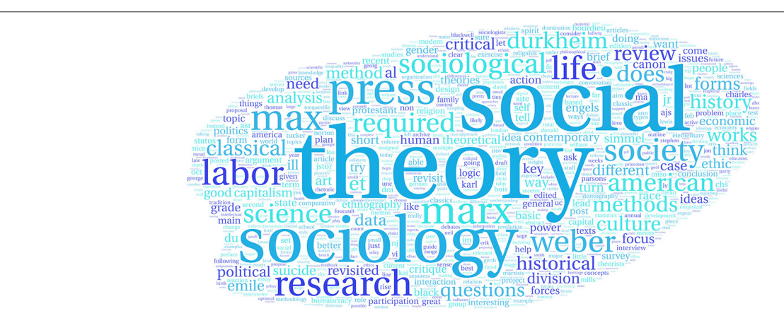
FIGURE 2 | A word cloud created from 9 syllabi and course descriptions of graudate introductory social theory / sociology courses from the top 12 programs.

Table 2 demonstrates the extent of involvement of evolutionary explanations in introductory sociology courses at top-ranked US universities. The single hit for the searched keywords comes from the title of Cooley (1902/1992), which is part of the readings at the introductory course for graduate students at Berkeley. One can confidently conclude that hardly any attention is devoted to evolutionary origins of social behavior in the introductory courses at the top-ranked US sociology programs.