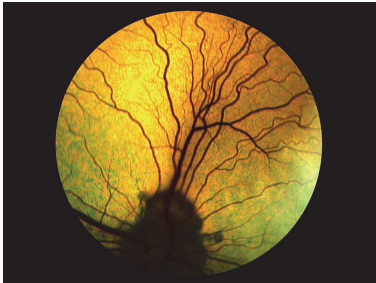
Fig. 2. Fundus appearance of 1-year-old male Crossbreed 2