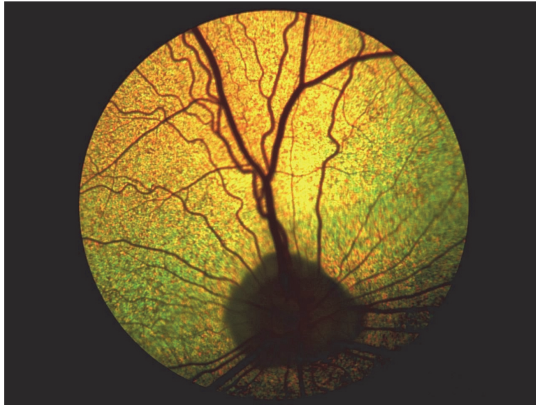
Fig. 1. Fundus appearance of 5-year-old male Labrador Retriever

phy (crd) may present the same behavioural signs and a lack of fundoscopic changes, in some cases even up to 3 years of age (Ropstad et al., 2007a). The diagnosis of cd should thus be confirmed with an ERG that determines the type and degree of severity of retinal lesions.