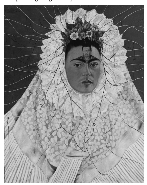
Figure 1: Frida Kahlo's painting Diego on My Mind

The painting is a portrayal of Frida in a traditional Mexican wedding dress. On her forehead there is a picture of her husband Diego, and on her head there is a crown made of flowers and leaves. One can see the veins of the leaves growing out of the crown, intertwining with Frida's hair and with the threads of her wedding dress, forming a beautiful image of a net. However, there is much more to the painting than its visual form being pleasing to the eye. Namely, these images work as aesthetic attributes, constituting the aesthetic idea. For example, the photograph of Diego on Frida's forehead may be said to be an aesthetic attribute standing for the constant preoccupation with the loved one, and the image of Frida's hair intertwined with her dress constituting an image of a net may be an aesthetic attribute of one's feeling of being trapped. The collection of these aesthetic attributes constitute the aesthetic idea of the painting, that is, a concrete sensible representation of an idea, such as the idea of captivity and the feeling of hopelessness that for example a bad marriage or an addictive relationship can induce. The combination of aesthetic attributes in this painting is internally coherent, purposive for the presentation of an idea and thus experienced with the feeling of pleasure.