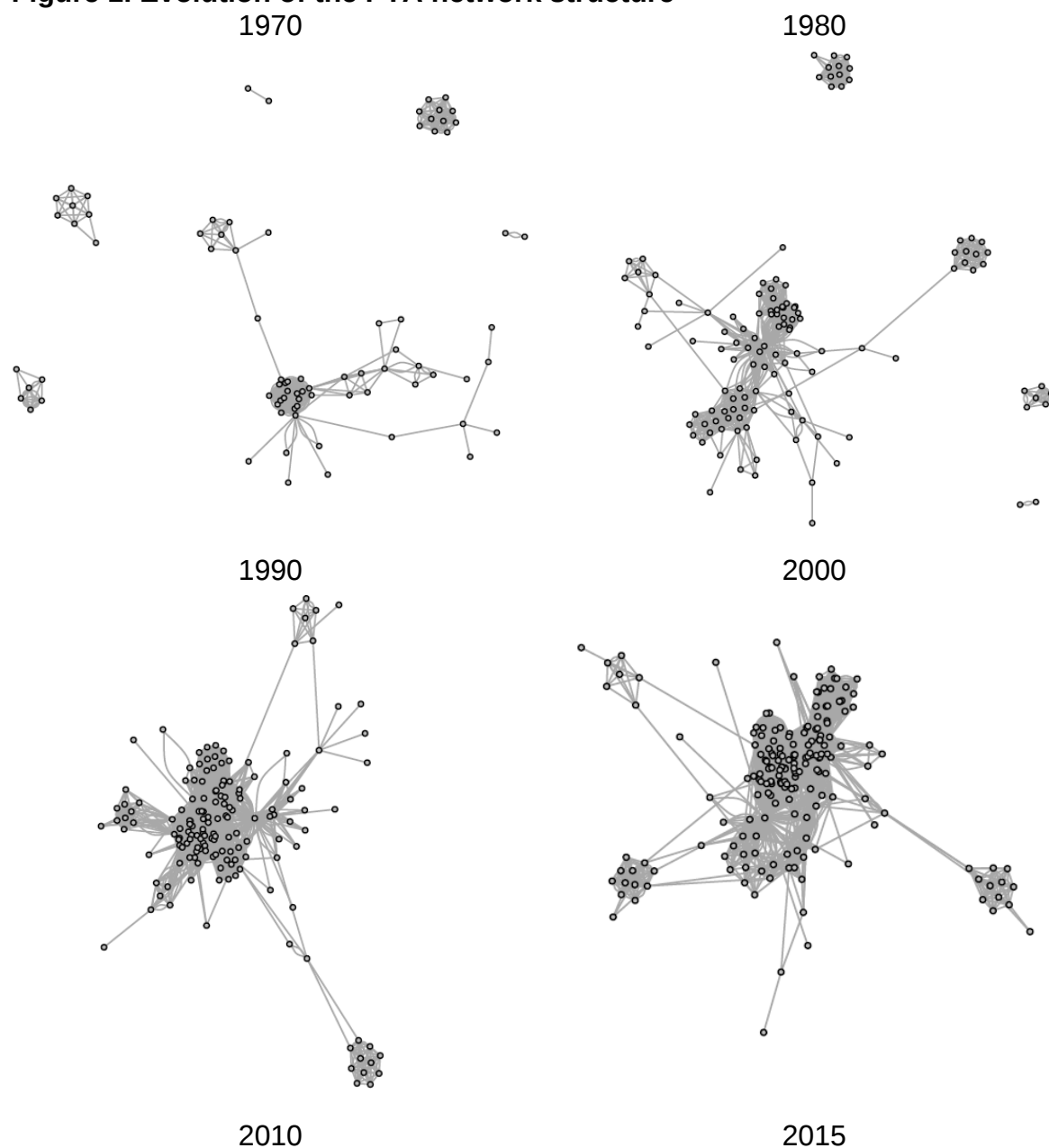
Figure 1. Evolution of the PTA network structure

like-minded elites contributed to the spread of trade agreements in the Pacific Rim. These trade agreements are linked and have formed a network structure. Figure 1 shows the evolution of the PTA network. Each node represents a country and each connection represents a PTA between countries. Research has revealed that this evolving network structure influences the ways in which countries interpret existing agreements and negotiate new ones. According to Lee and Bai (2013), “transitivity” and “homophily” dynamics in the network of trade agreements explain why countries tend to join PTAs.