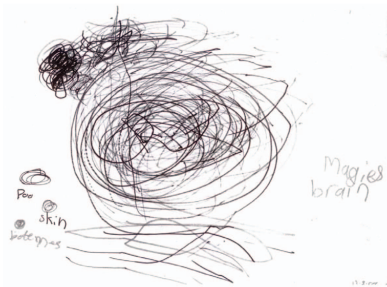
Figure 2. Messed up mind.

result of a violent intrusion rather than a loving relationship, which serves as a model for an internal representation of linking. Paul would often angrily shout at me about how revolting I was – therapy gave him the opportunity to explore in a projected form his fears and worries about what kind of baby he was and the kind of parents, both internal and external, with whom he had to struggle. Clearly, this was a much safer endeavour than trying to explore these issues with his new parents.