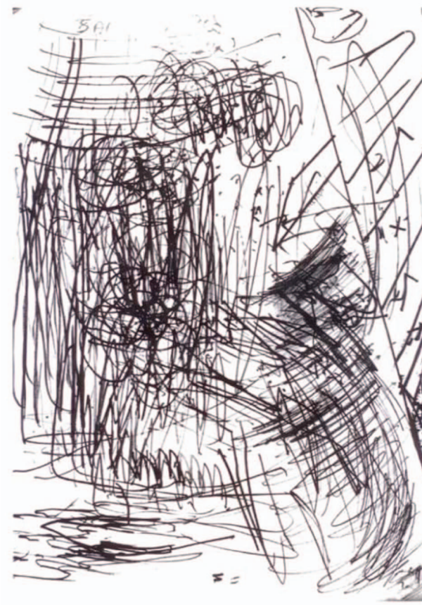
Figure 3. 'Different places, same time'.

worlds both internally and externally. He gave the picture the poetic and thought-provoking title of 'Different places, same time'. The picture began with a line drawn with a ruler. On the right hand side is a sort of register, a differentiation between past and present, something quite organised, albeit very rigid and with the ticks upside down. We thought about this in relation to reliably going to school and having a bedtime, getting up in the morning and having a packed lunch – the sorts of things which were unreliable in Paul's earlier experiences. (In a previous drawing of a house he had described how this was a place where night became day, and where the family ate upstairs and went to bed downstairs.) On the left hand side is a picture of an entirely different kind, something more chaotic and undifferentiated. But within the swirling lines (as with the previous drawing above of 'Maggie's brain'), it is just possible to see a form – perhaps a mother bending down to her child? It may be that the drawing also represented the struggle between everything happening at the same time because of a lack of containment and organisation, and the beginnings of differentiation achieved through a greater experience of containment. This then allowed for the past and the present to be held more distinctly rather than as substitutive realities vying for ascendancy.