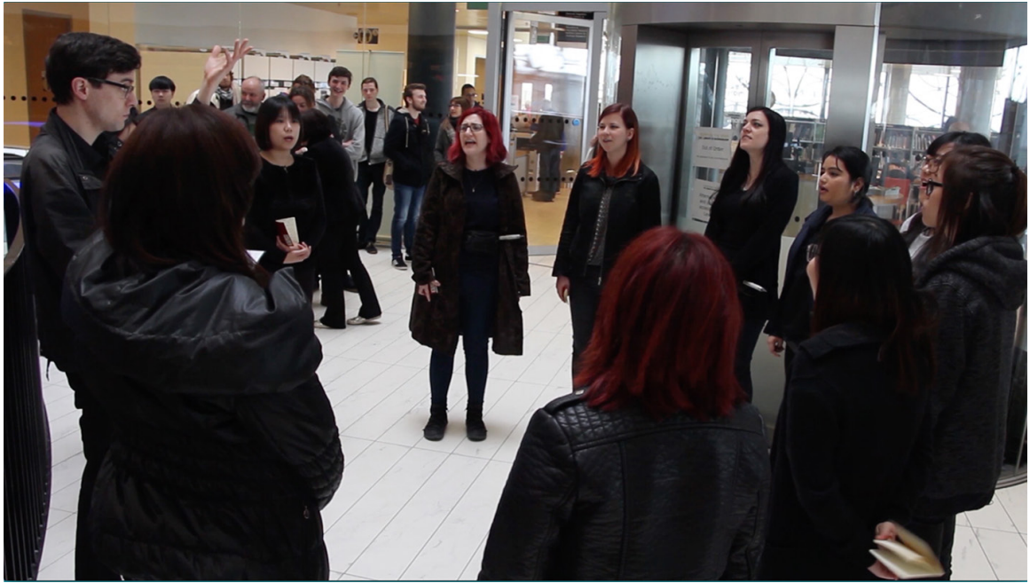
Figure 6. Translation Zone(s): A Stuttering (2016). Digital video still of participants performing on level 4 at the entrance to the cylindrical tower that ascends to the top of the Library of Birmingham.

While the English alphabet operated as a point of reference for the audience, the work sought to negate the dominance of the English language by giving prominence to the other languages and making the differences tangible. This was done by inviting the participants to enunciate their alphabets in both their named and phonetic forms: those without named letters remained silent during that section, and all the participants fell silent as soon as they had exhausted the letters in their “alphabet.” Thus the audience could hear and see the differences, as they listened to the familiar and unfamiliar sounds and observed the varying lengths of time the participants took to enunciate (for example see video 1.00-1.13 mins). The staggered finishing times of each alphabet drew attention to the lack of any overarching standard and the inadequacy of conceptualising language as a code of equivalents (a common misconception amongst monolingual speakers). English was used sparingly in the performance itself, ‘in order to focus on the sounds of language, “the grain of the voice” (cf. Barthes) and to indicate the genesis of the work to the audience. In fact, it was only in the latter stages of the project that I realised that I did not have a native English performer and I had inadvertently omitted English from the score. In my desire to make the other languages more visible and audible, I had unwittingly silenced my own.