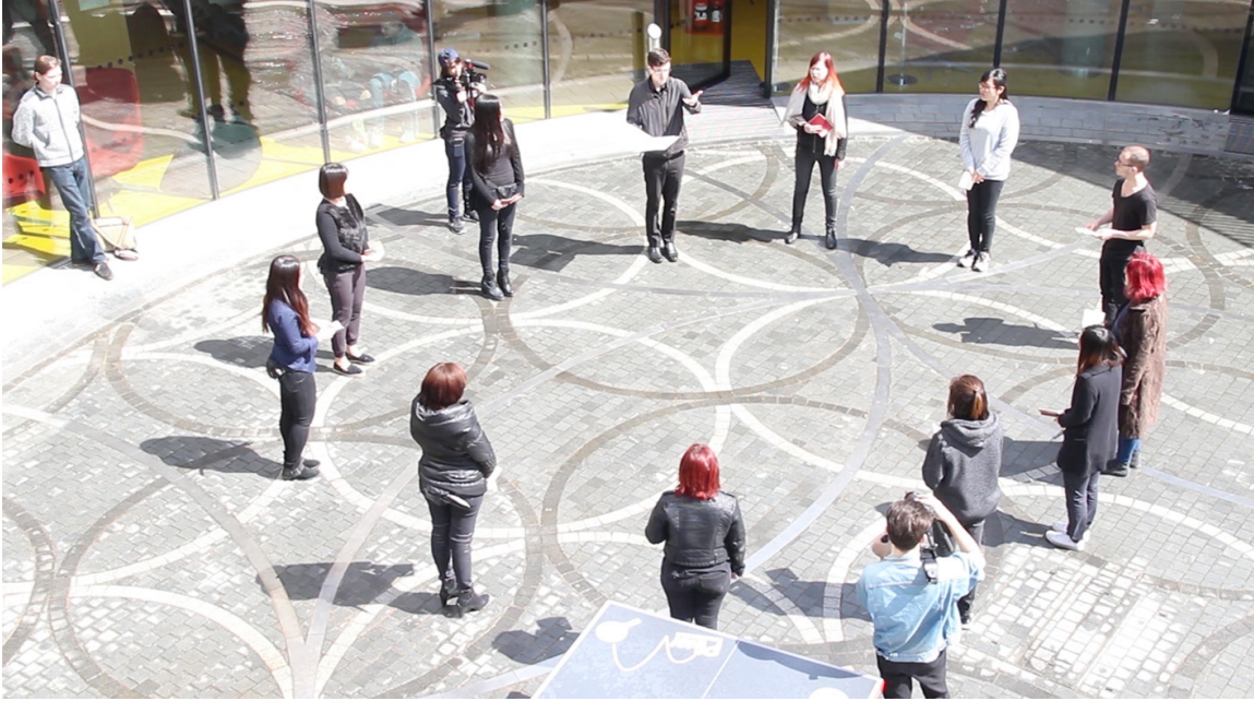
Figure 4. Translation Zone(s): A Stuttering (2016). Digital video still of participants performing in the rotunda, the basement of the Library of Birmingham

(see Figure 4), the duos and trios on the travelator (see Figure 5) and stutter on the top floor at the base of a cylindrical tower which can be seen as a reference to the tower of Babel (see fig. 6 and see video 2.24-2.37 mins.). Each site provided a structure and backdrop to the work which expanded its Textuality (cf. Barthes From Work to Text ) and contributed to the effect on the audiences who experienced the live work as well as on those who watch the video.