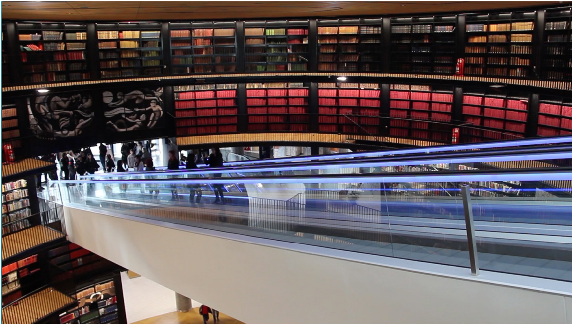
Figure 5. Translation Zone(s): A Stuttering (2016). Digital video still of participants performing on the travelator in the Library of Birmingham