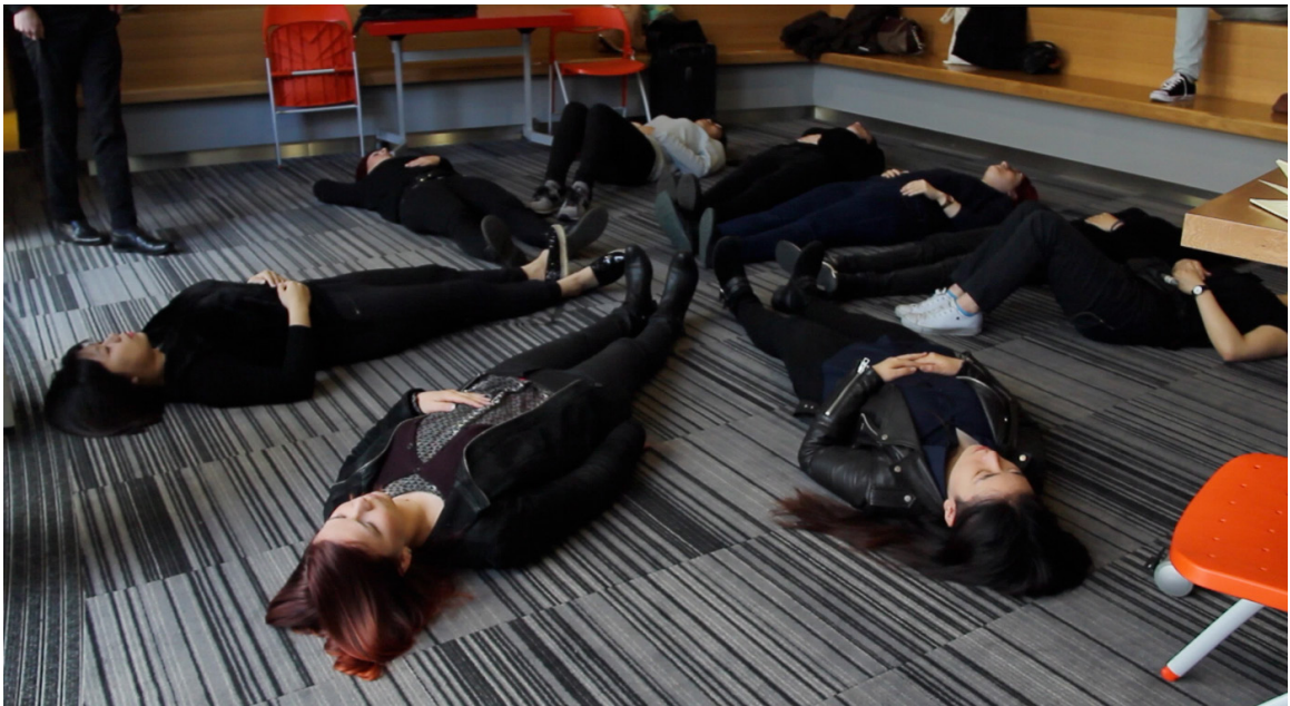
Figure 3. Video still of rehearsal (breathing exercises) at the Library of Birmingham

The sound work was devised through a series of stages. Firstly, I divided the audio recording of each alphabet into individual units and grouped similar sounds together, for example, many languages share “a, ah, aaa” sounds; secondly, I experimented with these groups digitally, exploring different rhythms, harmonies and sounds I wanted to put together; thirdly, I worked with the composer and conductor to devise exercises to test these out within the workshops; fourthly, I observed how the sounds worked when performed by the participants, noting what was difficult to perform and so forth; finally I reviewed the video footage and my notes following each workshop and proceeded to select and refine the “score.” This process was repeated week after week. During the workshops the participants became familiar with the conductor’s gestures, learned how to use their bodies to perform (see Figure 3), to inhale and exhale consciously, to use their voices effectively, to feel the sounds as they rose up from and resound in their torso, to pay attention to each other, to work with one another—in harmony and discord, to interpret and follow each other’s leads. As they played host and guest to each other’s languages, their mother-tongue became increasingly estranged, as it collided and morphed into abstract sounds and material to play with. Their mother-tongue became an Other tongue—in an act of alterity.