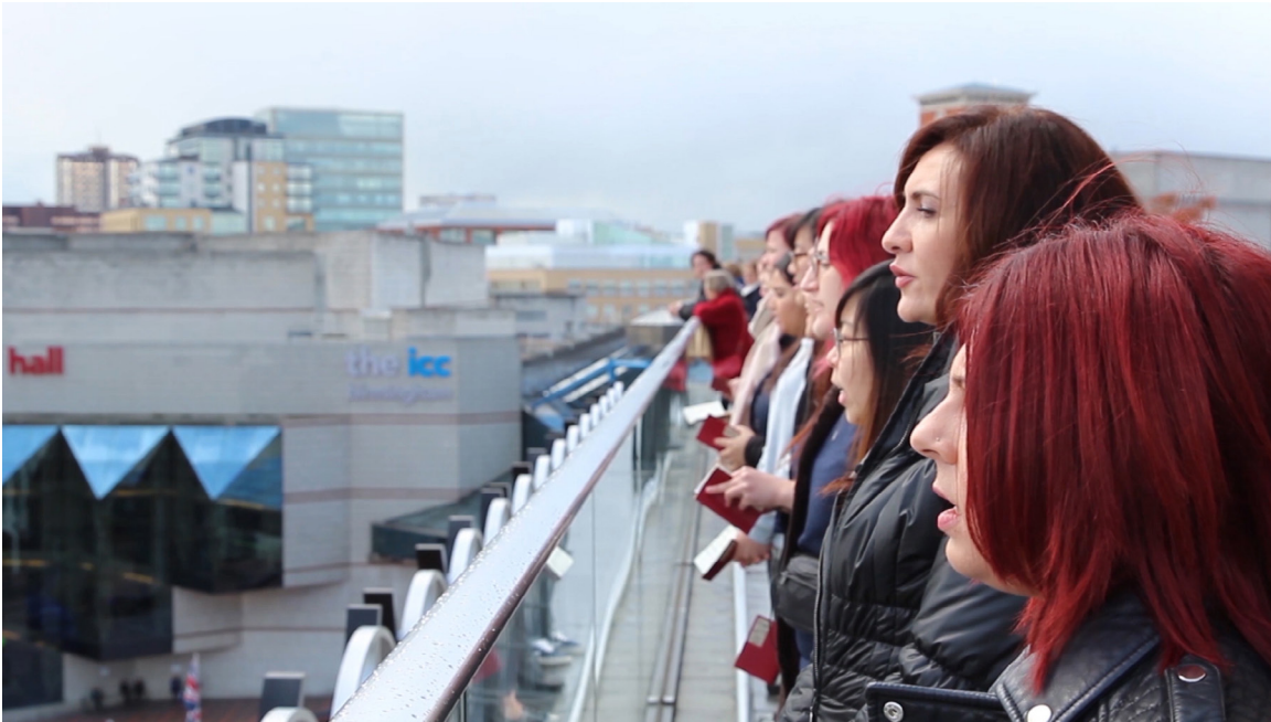
Figure 1. Video still from Translation Zones: A Stuttering which can be seen at: https://vimeo.com/172641096

creation of a series of “zones” builds on Mary Louise Pratt’s “contact zone,” which informed Emily Apter’s book Translation Zone , a term that Apter uses to designate “sites that are ‘in-translation,’” in motion, sites “that belong to no single, discrete language or single medium of communication” (6). “Zone” also implies the configuration of a collection of ideas, objects and activities that occur in a delimited area and connotes the project’s focus on language as and in a state of becoming, rather than a static carrier of meaning (cf. Deleuze and Guattari: “zones of indiscernibility”). These “Zones” create the conditions for diverse elements to form new relations. This results in a hospitable place (not necessarily a harmonious one) where cultural literacy thrives as differences are debated, and alternative perspectives emerge.