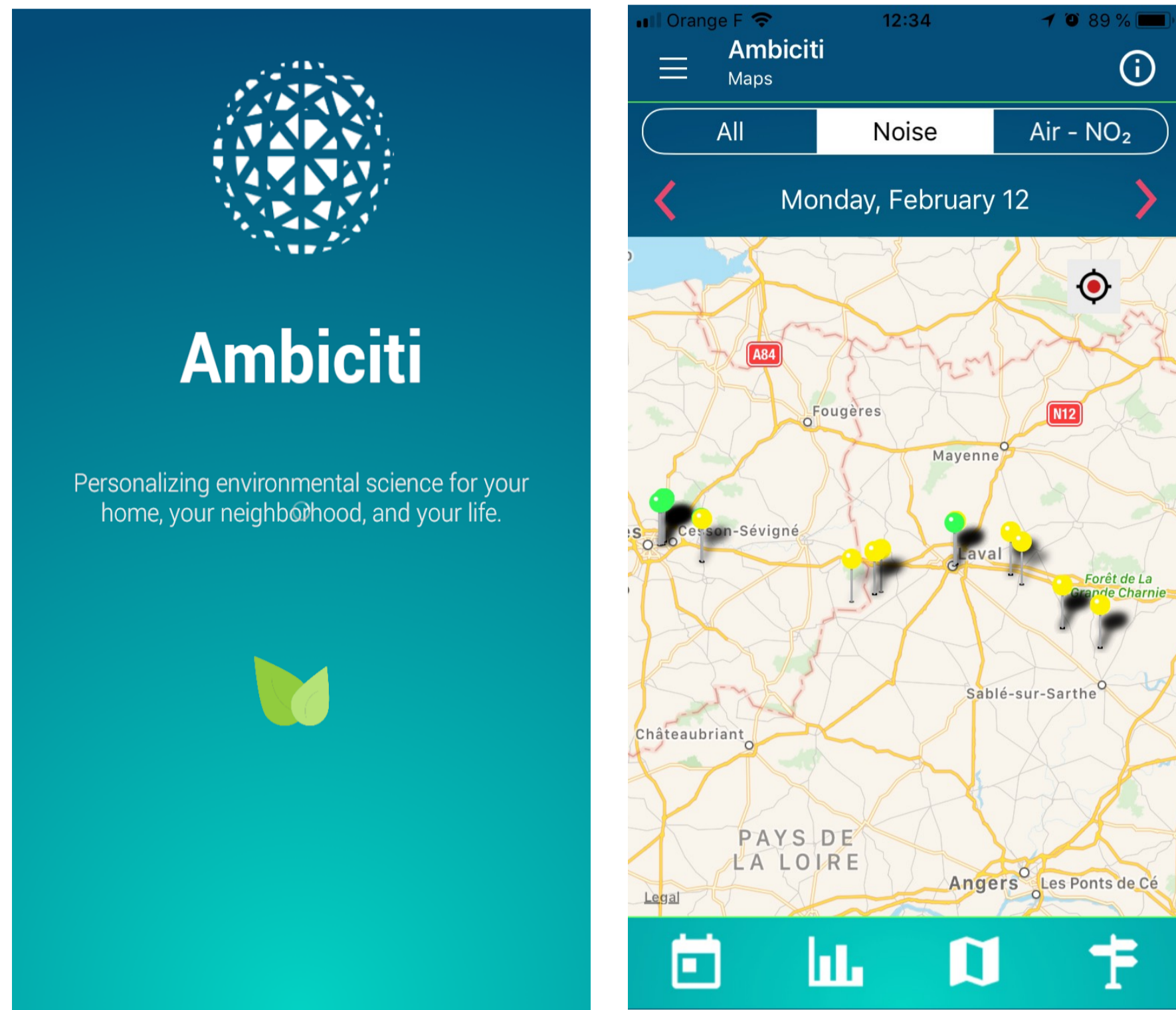
FIGURE 1: Ambiciti application (formerly called as SoundCity) monitors the environmental pollution the user is exposed to [3].