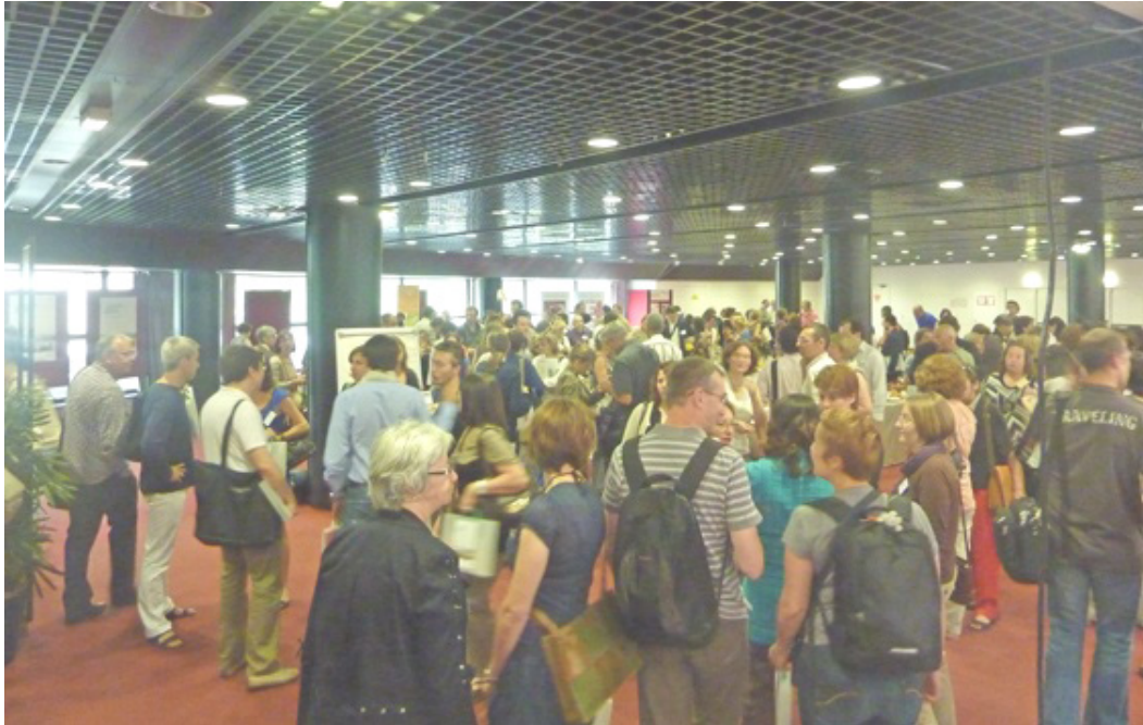
Figure 4: Delegates to JABES 2013 in conversation

(enhanced access to print and e-collections, wide connectivity with local existing systems and provision of resolver services for libraries not as yet equipped and connection to national licensed platforms), he described the likely different scenarios: implementation of a discovery portal, creation of a centralised index, development of a national locator service. The latter seems the most feasible option in the current French configuration. It would seem to call for the creation of a national knowledge base (to cover local resources absent from the international knowledge bases), which would be complemented by data from existing international projects such as KB+ from Jisc and GOKb. Data would be enriched by the metadata hub [28] currently prototyped by the ABES team as well. The development of this national locator system is a first step in a possible migration towards a global cloud-based information infrastructure.