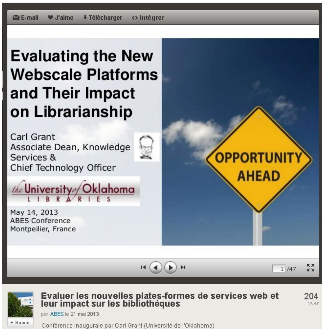
Figure 1: Opening page of ‘Evaluating the Webscale Platforms and Their Impact on Librarianship’

Library services platforms can help libraries achieve this goal, though libraries also need to be able to connect to the numerous services on the Web where the users are, and where the discovery overwhelmingly takes place. Developing platforms allowing users to discover established information as well as creating new material may assuredly be a path to follow for librarians.