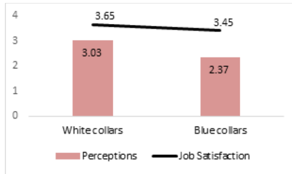
Figure 2. Perceptions and Job Relationship

To understand the impact of perceptions on job satisfaction and stress, a comparative analysis is shown in figure 2. This indicates that white-collar employees are relatively more satisfied with their jobs (3.65) as compared to blue-collar employees (3.45). Job satisfaction levels of both groups is reasonably high showing that a vast majority is satisfied with the work and does not find it stressful. Conclusively, the perceptions of white-collar participants about standardized work were positive and they were highly satisfied with the job whereas, blue-collar perceptions were comparatively negative and they were less satisfied with the job. In this way, a direct relationship between positive perceptions and job satisfaction and the inverse relationship of positive perceptions with stress has been determined.