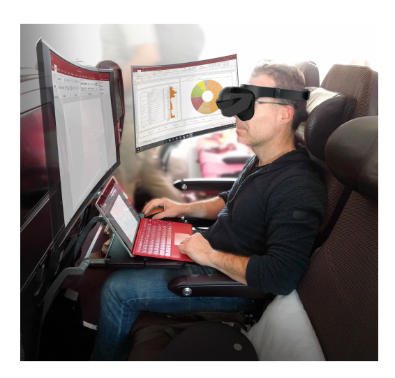
Figure 2: A vision of the future mobile information worker. The user can benefit from typing abilities provided by a laptop or tablet and VR provides an immersive virtual multi-display environment.

While transplanting standard keyboards to VR is viable, there are design parameters that are currently still unknown that can plausibly affect performance. First, the performance differential and skill transfer afforded by a desktop keyboard or touchscreen keyboard in VR is not well-understood. While both techniques benefit from being familiar to users, they also provide certain advantages and disadvantages. A desktop keyboard provides tactile sensation feedback of the keys to the user, thereby potentially lessening the importance of visually conveying the location of the user's fingertips in relation to the keyboard in the VR scene. On the other hand, touchscreen keyboard input carried out via a tablet allow for a user interface that can be easily reconfigured and support additional user interface actions, such as crossing, steering and gesturing. Hence, the choice between a desktop and touchscreen keyboard is a cost-