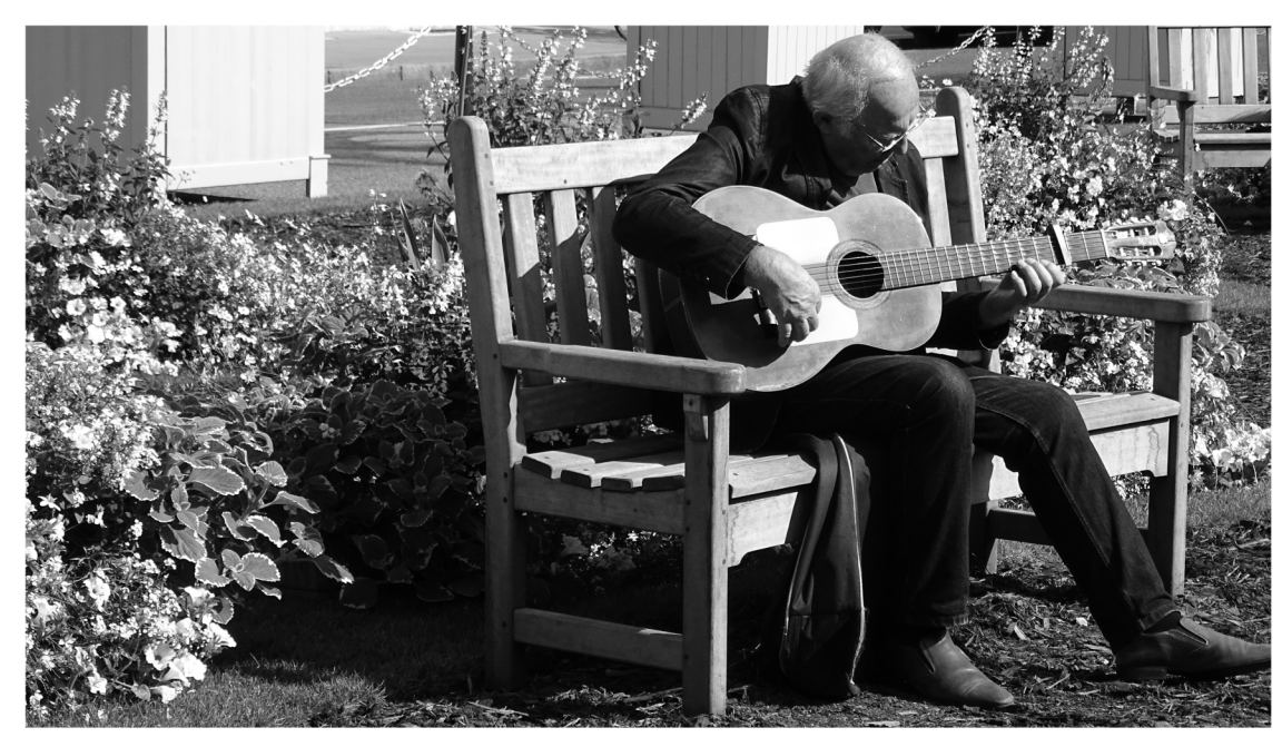
Fig 1. Upper image, example of distressing image. Lower image, example of a non-distressing image. Representative images are used in accordance with the copyright restrictions of the original images. Stimuli from the task are available on request.

https://doi.org/10.1371/journal.pone.0198273.g001