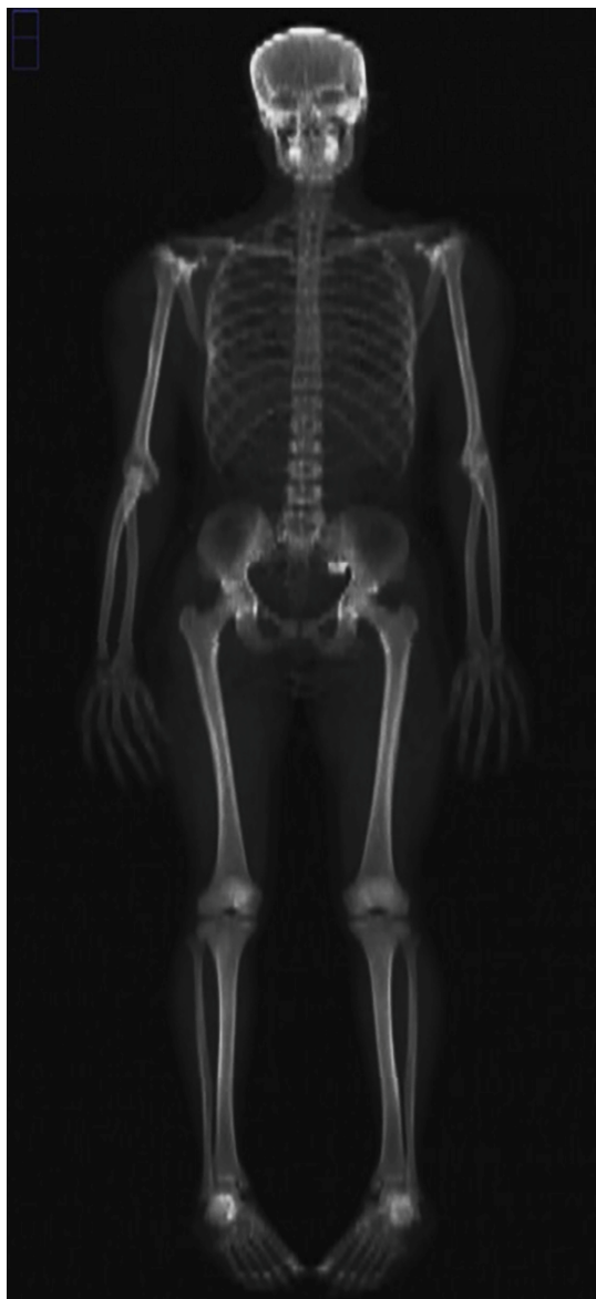
Figure 1: Example whole body DXA image used in this study