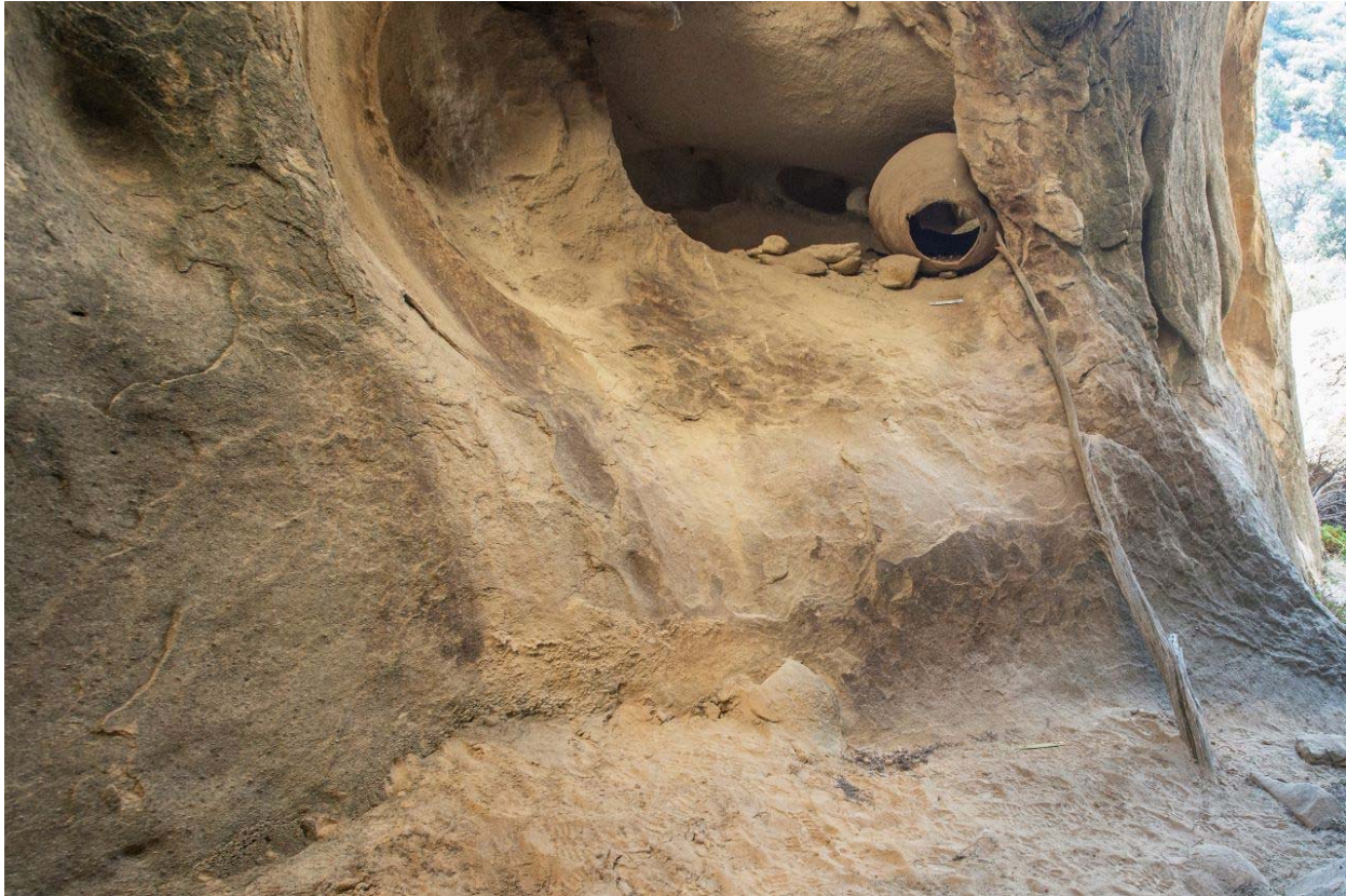
Figure 5. Bryne Cache in situ with cave stick.

and location within the storage basket suggests it likely served as the storage basket base, a repair after the initial base was lost. It is not evident whether the basket was intentionally made to serve as a base for the storage basket (B1), or, whether the basket was repurposed as the base after being damaged.