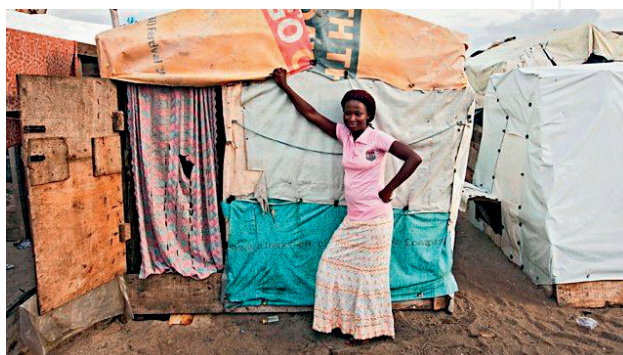
Figure 4. A slum in central Lagos. Picture credit: BBC [11].