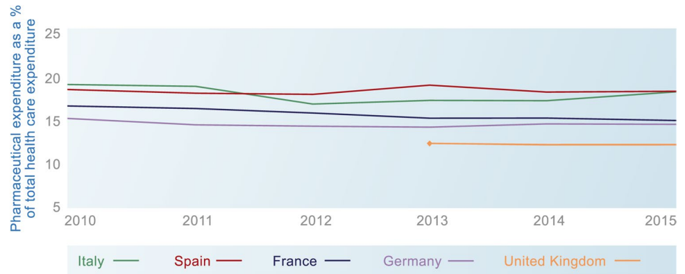
Fig. 3 Pharmaceutical expenditure as a percentage of healthcare expenditure in EU5 countries, 2010–2015 (Organisation for Economic Co-operation and Development data on pharmaceutical expenditure)

decrease over time and, thus, net expenditure growth would be higher than list expenditure.