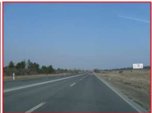
Figure 5. Road N8 with elevated speed limit, v_{perm} = 100 kmph, v_{avg} = 103 kmph