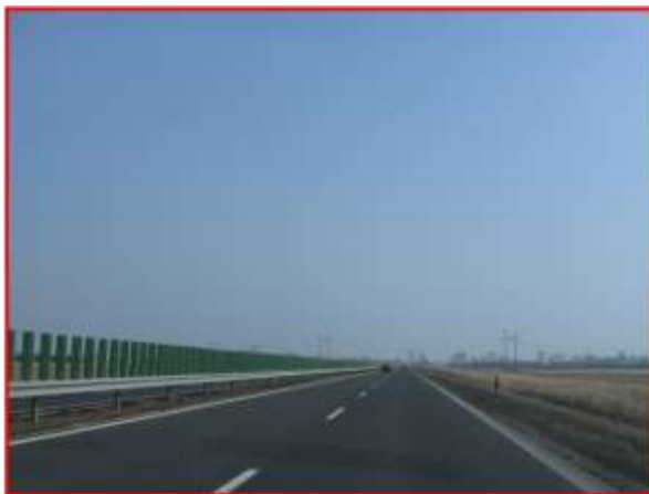
Figure 4. Road N8 with elevated speed limit, v_{perm} = 110 kmph, v_{avg} = 115 kmph