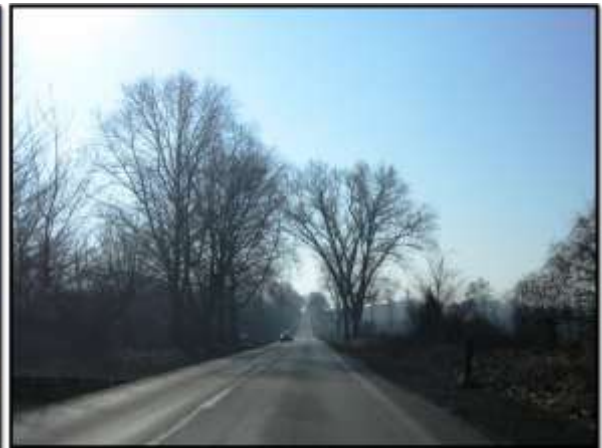
Figure 3. Road N81, v_{perm} = 90 km/h, v_{avg} = 87 kmph