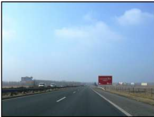
Figure 2. Motorway M7, v_{perm} = 130 kmph, v_{avg} = 126 kmph