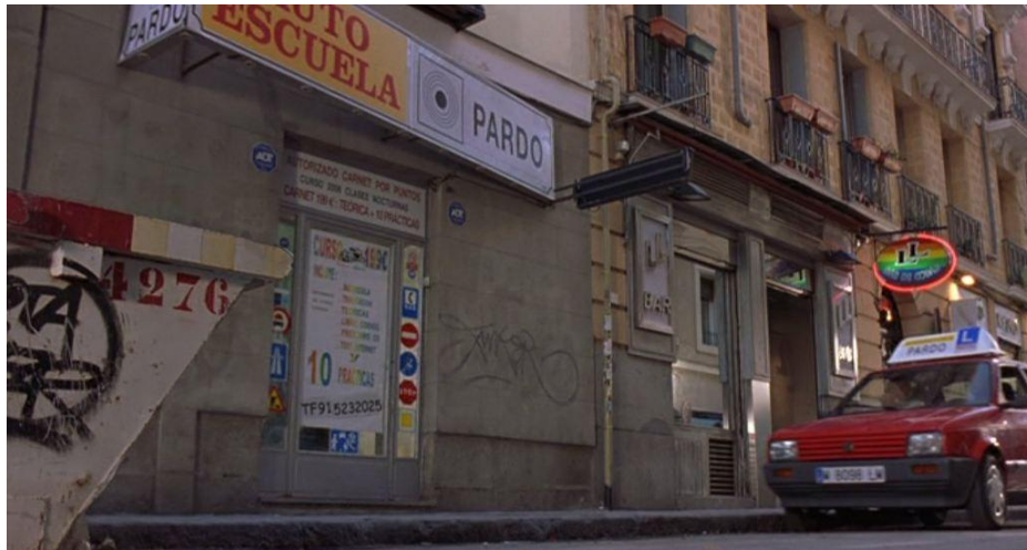
Figure 3 – Auto Escuela Pardo in Chuecatown

Leo – and his homophobic employer – work, not to mention the greengrocers’ shop owned by Leo and Rey’s straight best friend – the traditionally named Lola (Mariola Fuentes). We also see this in the police station, with its Spanish flags and photos of King Juan Carlos, and in the shabby, dated hospital where Leo and Rey are reprimanded by a homophobic nurse for kissing and then again for talking too loudly: ‘señores, casi prefiero que se besen’ (‘gentlemen, I’d almost prefer it if you kissed each other’). The nurse’s words can perhaps be seen to signify the homophobia of traditional institutions more widely.