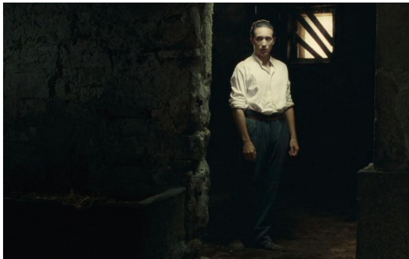
Figure 13 – Pitorliua in Pa negra

Although we could assume that the attack on Pitorliua is a special, unique, case (there is nothing in the film that suggests otherwise), Richard Cleminson and Francisco Vázquez García (2007) have discussed the relationship between the social construction of masculinity and national identity in Spain from 1850 till the end of the Civil War in 1939. During the Francoist regime national identity was traditionally viewed as being shored up 'by masculine values,' which at the time were equated with 'bravery, sacrifice, strength and willpower', and any decline in those values was seen as an 'attack on the substance of the nation' (2007: 175; see also Cleminson and Vázquez García (2007: 175-215)). At a time when Franco was instigating nationalistic, phallogentric and heteronormative ideals, then, Pitorliua (and other 'homosexuals' like him), had to be exterminated. Even if Pitorliua appears only briefly during the castration scene, 53 it is interesting to note how he is characterised physically, as it helps understand how the body of the 'other' is represented. In Pa negra , and to an extent in El mar as well, gay male characters are not only linked to disease and death, but they are also feminised. By making Pitorliua effeminate, the narrative establishes him as different, 'other'.