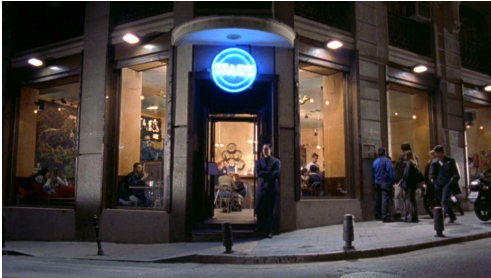
Figure 1 – STAR'S pub in Sobreviviré

Ricardo Llamas and Francisco Javier Vidarte (1999) argue that this new type of queer establishment was often designed with maximum visibility in mind, almost exhibiting its clientele as exotic fish in a bowl for everyone to admire (1999: 219). Such an approach is surely borne in reaction to years of hiding, marginalisation, and discretion. Llamas and Vidarte also comment that these new commercial buildings were often completely over-lit, again highlighting the new-found willingness to move out of the literal and metaphorical darkness and leave behind the life of what they call ‘vampires’ (1999: 219).