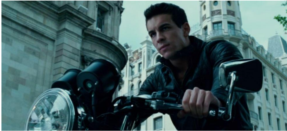
Figure 12 – Mario Casas as Hache in Tres metros sobre el cielo