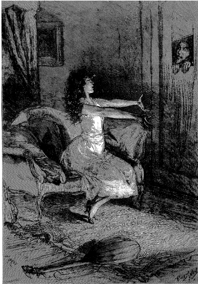
Oh ! viens... viens... viens... (P. 1083.)

Eugène Sue. 1885. Les Mystères de Paris . Paris: Jules Rouff et Cie (TOFANI II), p. 1081