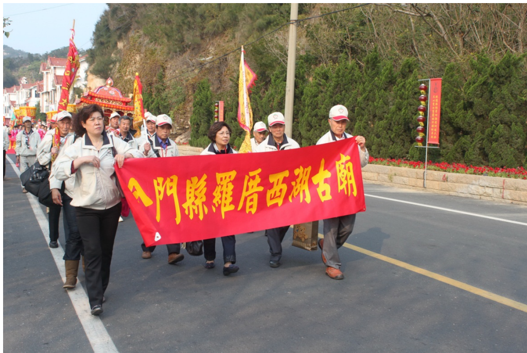
Figure 6.10 Cloth banner as identity marker of pilgrims’ association with their Mazu temple

as they are foregrounded in such pilgrimage performances” (Sangren, 2000: 99). However, these pilgrims still reside in liminal spaces, away from their local social structure. Although they carry with them their local identities and are embodiments of those identities, the liminal state itself, renders an arena for them to be more liberal in their performance of those identities, and ultimately influences their perceptions of the ‘other’ and thus interactions with them. This sets the tone for interrogating Taiwanese pilgrims’ encounter with their Chinese counterparts in the enchanted world of the Mazu cult, which the rest of the section now turns to.