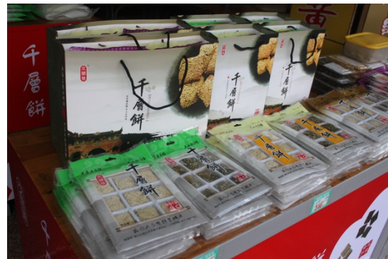
Figure 4.6 One of many shops selling ‘Chiang Clan Thousand-Layered Biscuit’ (Top); Thousand-Layered Biscuits in different flavours

Interestingly, my fieldtrip to Xikou coincided with a community twinning ceremony (社区结对仪式) between Fenghua and Da-shu (Kaohsiung, Taiwan). This ceremony was attended by Chinese officials from the Taiwan Affairs Office of Fenghua People’s