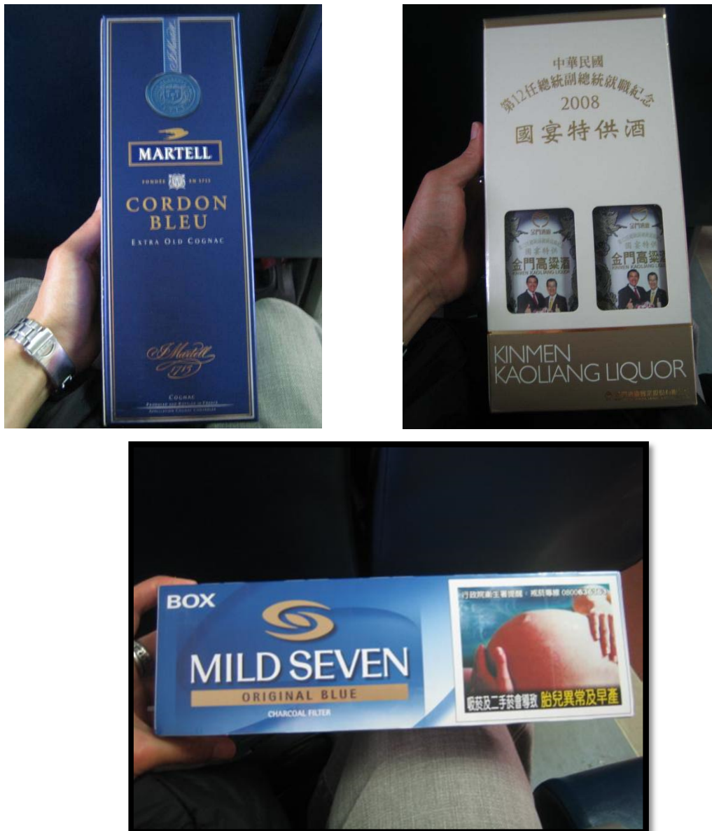
Figure 5.5 Examples of duty-free items

Taiwanese tourists would usually spend about fifteen minutes at the arrival hall of the ferry terminal waiting for their coaches and would often participate in such street economies with the locals. The tourists I spoke to revealed that the profit gained from the selling of duty-free items (Figure 5.5), which they have bought at the