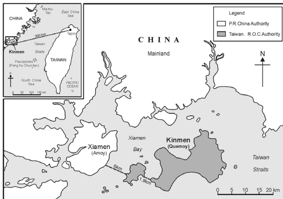
Figure 7.1 Location of Kinmen

Politically belonging to Taiwan, Kinmen is located 350km southwest of Taipei, Taiwan, but a mere 10km from the city of Xiamen in the People’s Republic of China (Figure 7.1).