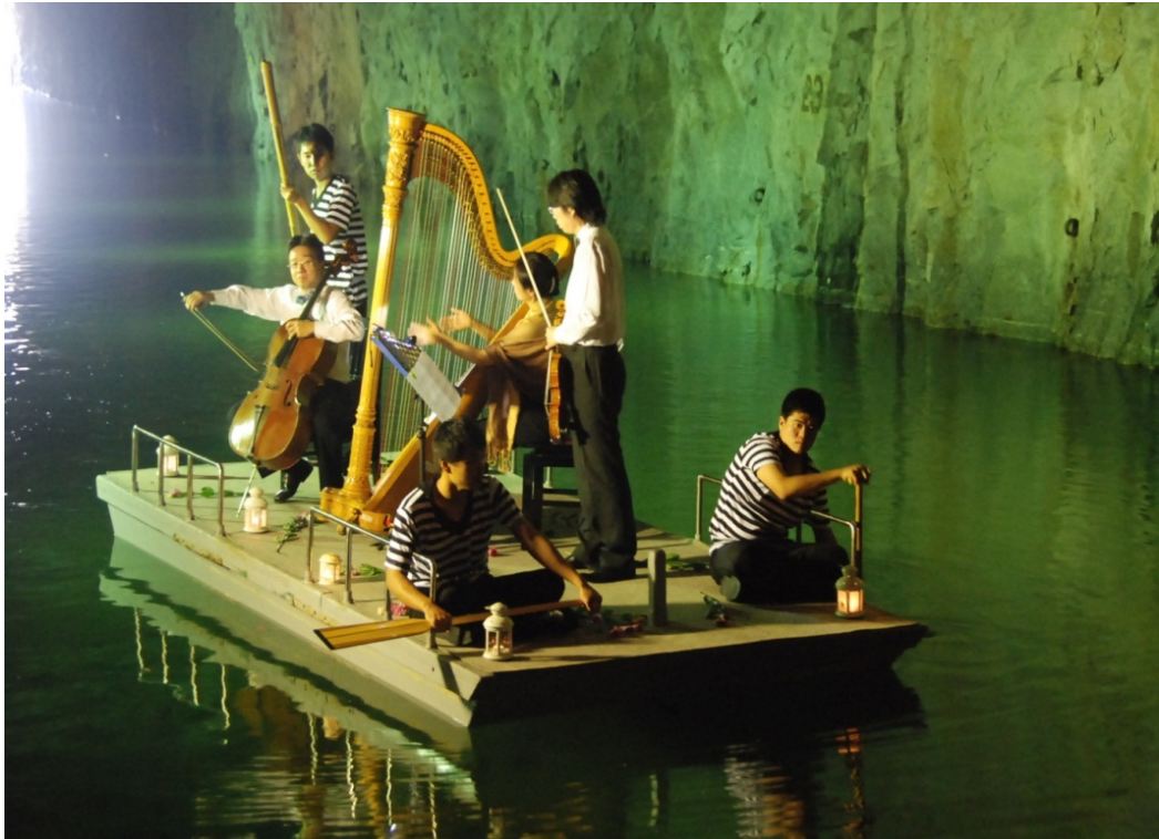
Figure 7.6 Zhaishan Tunnel Music Festival: Kinmen Harmony 2010