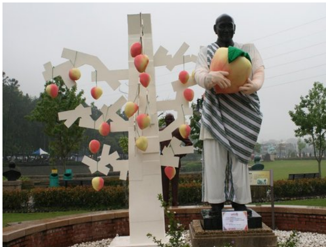
Figure 4.11 Chiang Kai-shek statues in different costumes