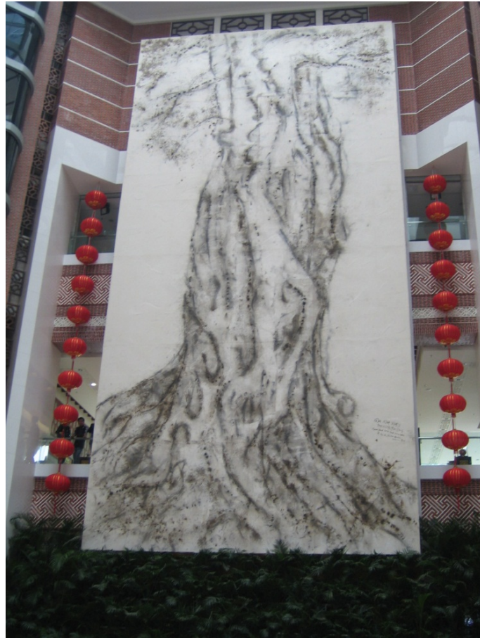
Figure 4.2 Cai Guoqiang's 'Gunpowder Painting'

designs showcase the Chinese government's desire for reunification. The theme of kinship and familial ties continues inside the museum – an 18m tall and 9m wide 'gunpowder painting' of a giant Banyan Tree with massive roots took centre stage in the reception hall (Figure 4.2).