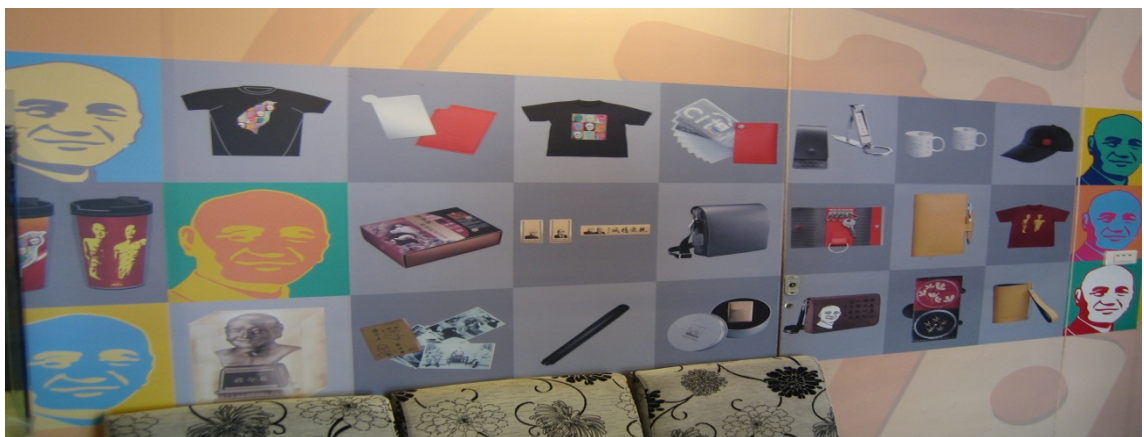
Figure 4.12 'Cartoonised' political figures & range of souvenirs at the Mausoleum (Top left: Chiang Kai-shek (left) and his son, Chiang Ching-kuo; Top right: Chiang Kai-shek (left) and Mao Zedong)