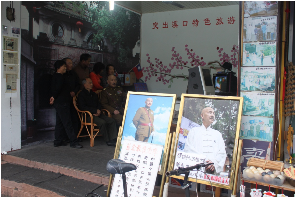
Figure 4.7 Photo-taking with Chiang Kai-shek impersonation

'listen to its family stories'. If biscuits and cuisines are not enough to fill the appetite of tourists, there are also gift shops selling 'Cross-strait Tourism Essentials' and a studio offering photo-taking services with a Chiang Kai-shek impersonation (Figure 4.7).