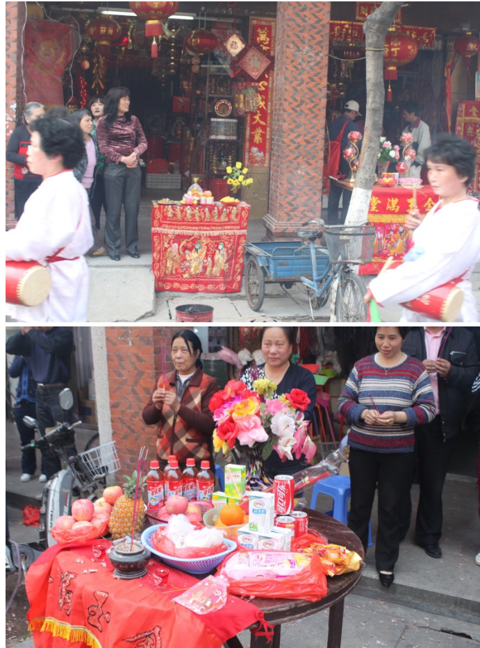
Figure 6.9 Chinese shop owners welcoming the Taiwanese Mazu procession with food offerings and incense

Yet, my participation observations revealed that there were also differences within this supposed unity of the pilgrims. The richer and thus more influential of the temple groups had more elaborated dresses and accessories for their goddesses, bigger sedan chairs and marched at the front of the procession. The identity of each group was very clearly represented by the cloth banner, embroidered with the name of its Mazu temple, behind which its followers marched (Figure 6.10). Pilgrims from the same temple association also shared the same coaches and sat at the same table during meal times. Therefore, as much as the pilgrimage is deemed to have created a united religious community, it has also helped to erect borders of differences at a variety of different scales. As such “identities are not so much temporarily discarded