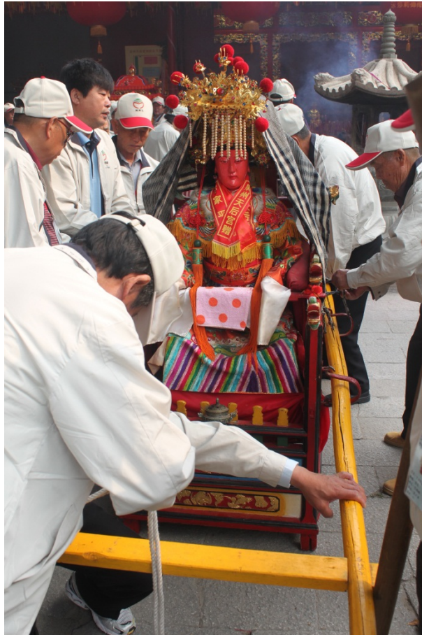
Figure 6.6 Pilgrims preparing their Mazu idol and sedan chair for a procession

The 'islandness' of such a cult centre and the idea of negotiating the 'mountain' (although only at a height of about 30m) to reach the ancestral temple contribute significantly to the overall sacredness of the pilgrimage. Amidst the blasting of firecrackers, Chinese trumpets, drums, gongs and cymbals, the ritual procession starts in earnest. At some point during the procession, sedan chairs can be seen swinging violently from side to side as handlers, both women and men, try to regain control of them; the tempo of the drums, gongs and cymbals keeping up with their movement. Handlers of Mazu's sedan chair have often shared their experiences of feeling the force of the goddess running through the chair itself, thus the rocking movement as they paraded towards the ancestral temple (Figure 6.7).