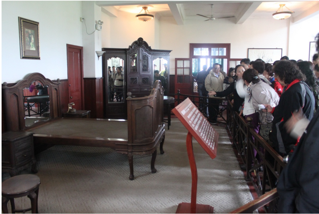
Figure 4.4 'Living quarters' of Chiang Kai-shek and Song Mei-ling

They seem to be following a prescribed script as the same narration is repeated by different tour guides over the course of the day. Black and white photographs of Chiang and his wife were hung on the walls of common corridors, each depicting the everyday life of the couple. Below is a selection of captions that follow each picture: