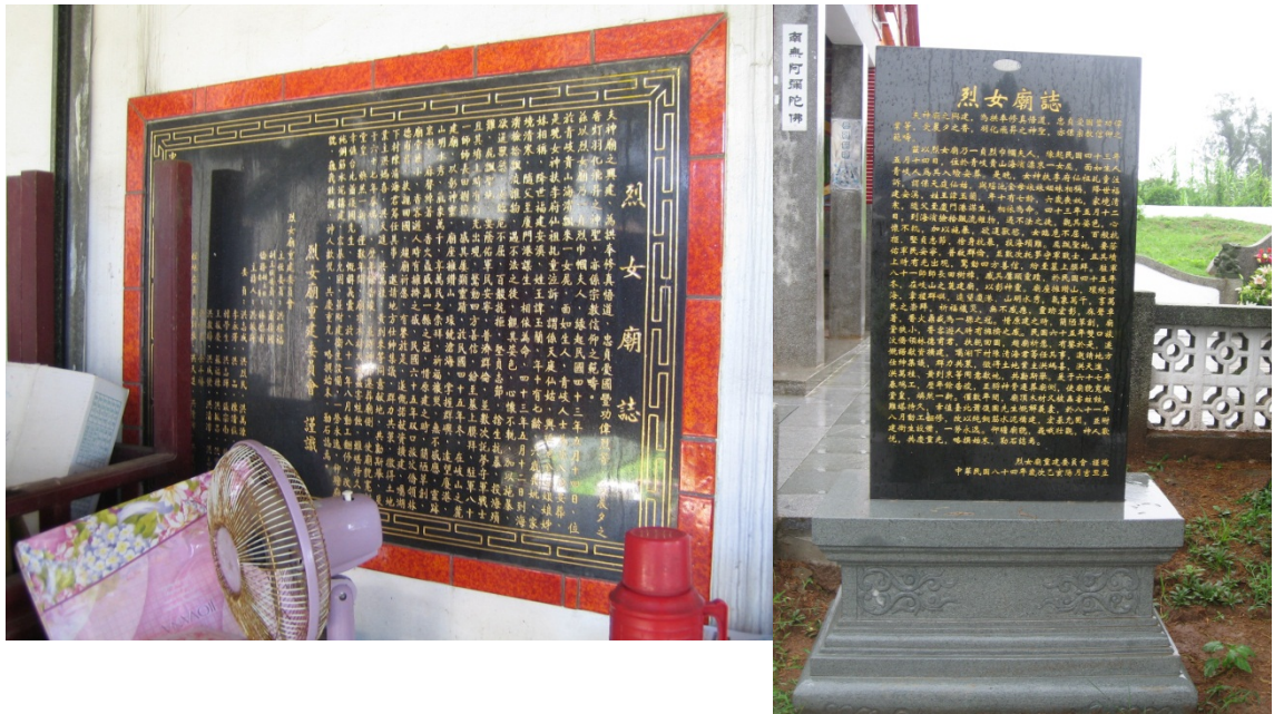
Figure 6.2 The old (left) and new introductory tablets to the Chaste Maiden Temple