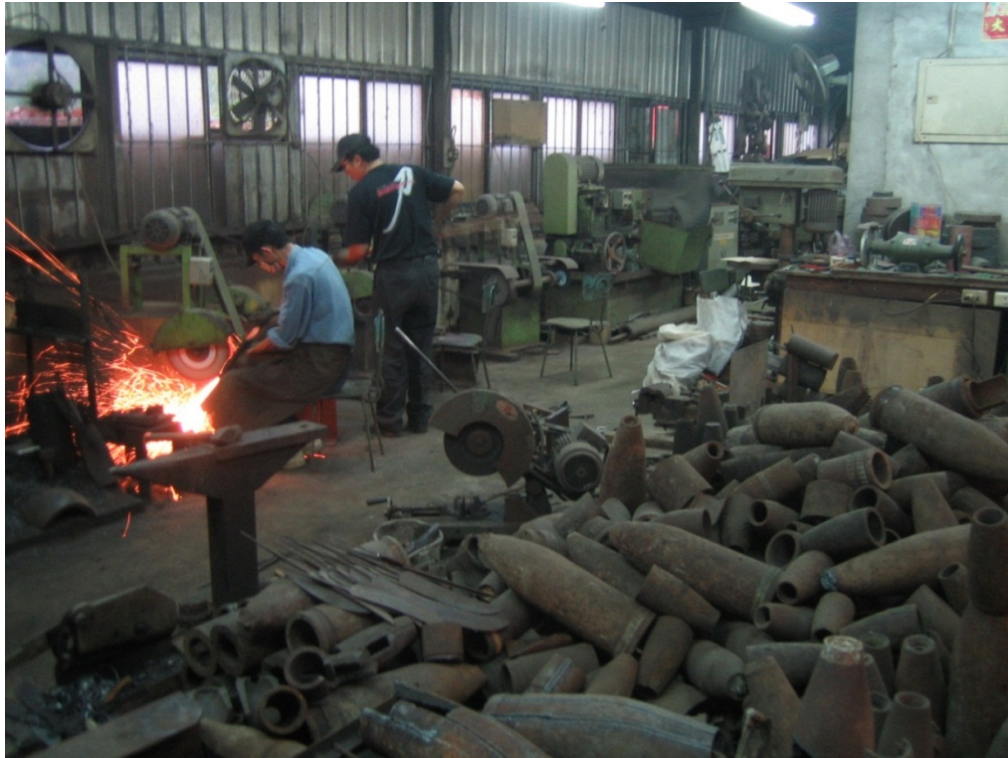
Figure 7.3 Making the Kinmen Knife amid a dump of artillery shell cases