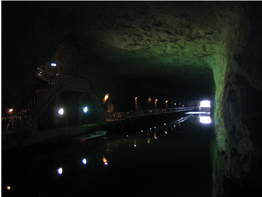
Figure 7.5 The Zhaishan Tunnel

to the ocean. In the tunnel, tourists get to see a series of rooms where the soldiers once lived. Tour guides ritualistically emphasise the “almost impossible task of excavating through the bedrock of granite gneiss” and the “sufferings that soldiers experienced during the round-the-clock construction”. Tourists are encouraged to “touch the granite structure, breathe in the dense air and imagine how life was like for the soldiers during the war.” Transforming military facilities and infrastructure into tourist sites and presenting them in their original state not only provides a unique experience for the tourists, but also “raise their emotional quotient by [allowing them to] empathis[e] with the events” (Muzaini, 2004: 53). Indeed, “much of the symbolic importance of these places stems from their emotional associations, the feelings they inspire of awe, dread, worry, [or] loss” (Davidson et al. , 2005: 3). After the martial law period and the gradual demilitarisation of the island, the tunnel