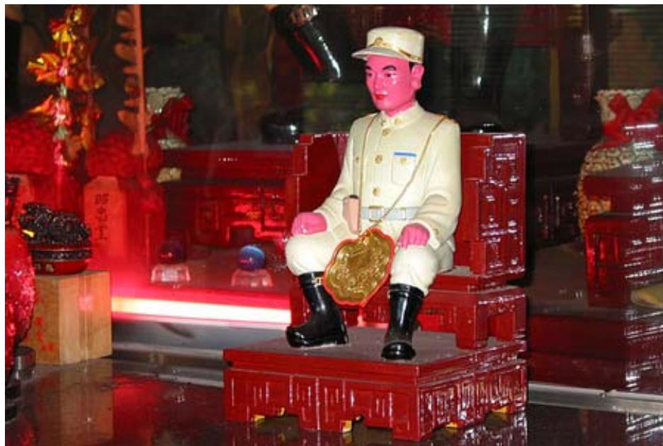
Figure 6.3 An idol of Colonel Lee Kuang-Chien

rapprochement climate. Most of these spirits were housed in temples across the islands (although locals believe that many still roam freely). One of such temples is the Lee Kuang-Chien Temple. Lee was a colonel in the nationalist army and died on the Kuningtou battlefield when leading a charge against the communist soldiers, who had landed on Kinmen in the hope of capturing and using it as a launch pad to attack the KMT on mainland Taiwan. Being the highest-ranked soldier to have sacrificed, Colonel Lee was commemorated for his valour and deified at a temple dedicated to him (Figure 6.3).