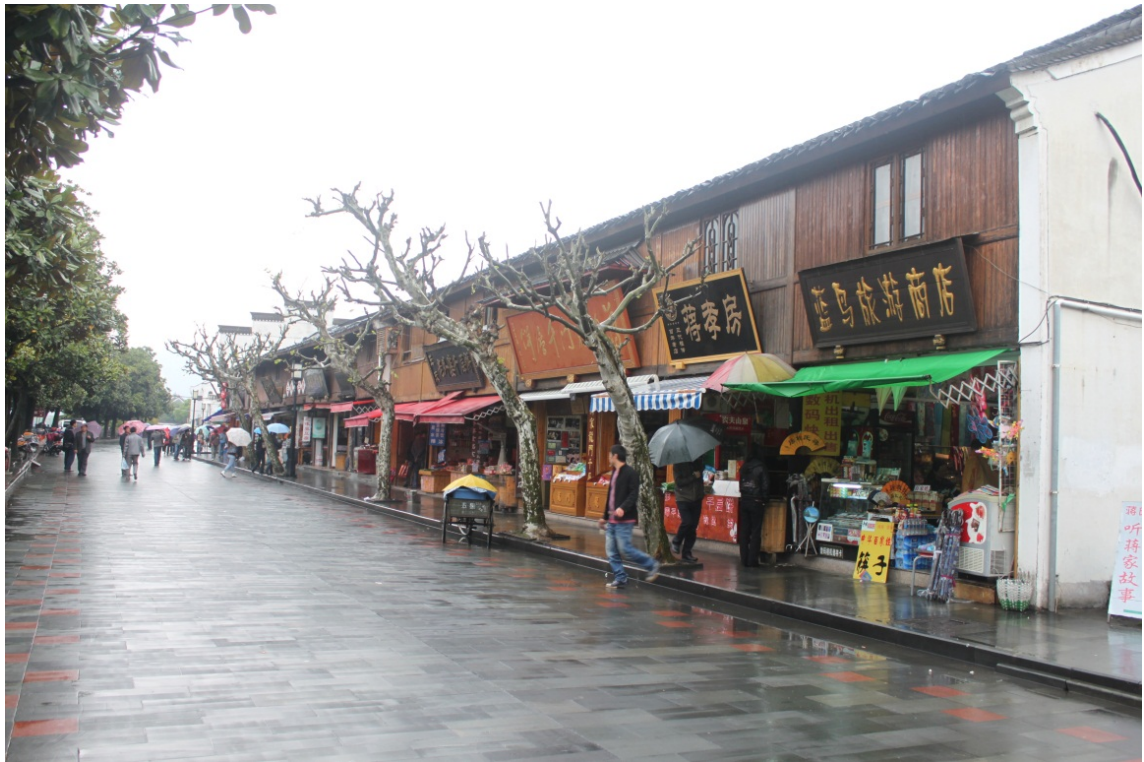
Figure 4.5 Main thoroughfare of Xikou Village