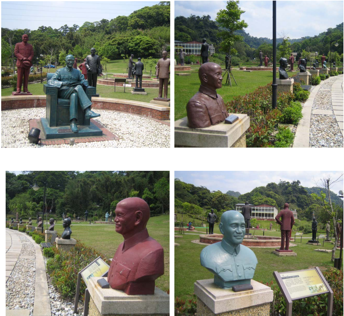
Figure 4.10 Bronze statues and busts of Chiang Kai-shek at the Ci-hu Memorial Sculpture Park

power, the materiality of these bronze structures, which once exuded nationalistic vigour, seems to soften into the greenery of the park (Figure 4.10).