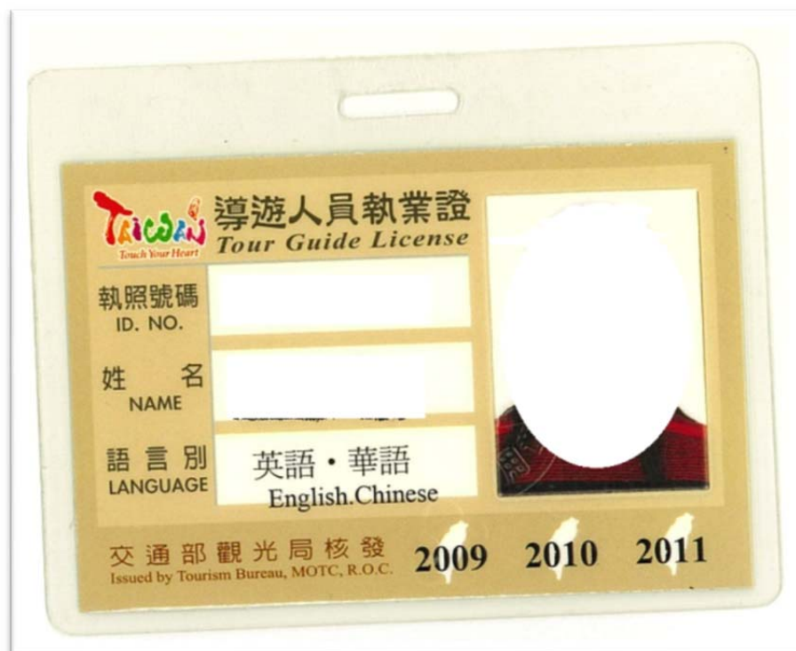
Figure 5.3 A Taiwanese tour guide license

L: Haha...Taiwan is not part of them at all...just that we wanted to take advantage! If they don't accept, we can say “hmm...I think there's some problem with your notion of national identity”...hahaha...this method is great...I'll have to use it next time!