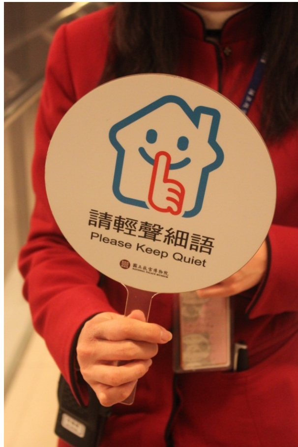
Figure 4.9 ‘Please Keep Quiet’ sign

It might have taken 360 years for the two sections of the same painting to come together, but ‘reuniting’ people from China and Taiwan might be an even more daunting task.