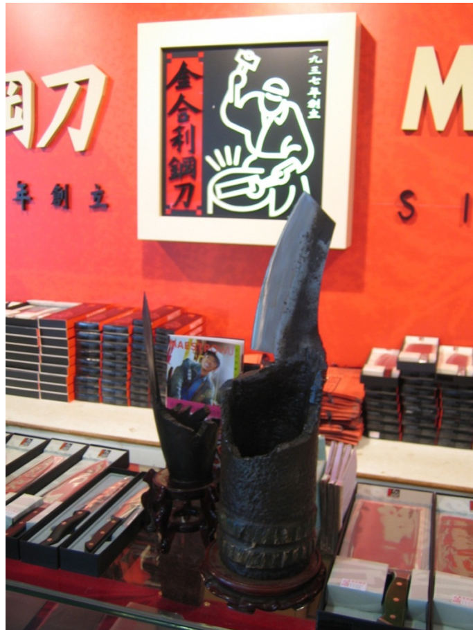
Figure 7.4 Half-knife half-artillery shell display

an everyday household item. The knife takes on a new role, however, to “remind the users of the kinship and culture that both sides share”.