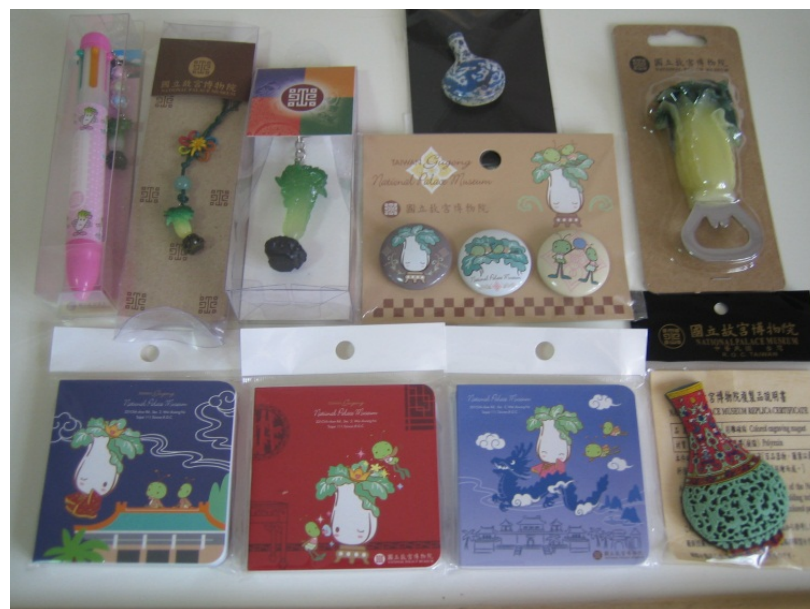
Figure 4.8 Examples of museum souvenirs