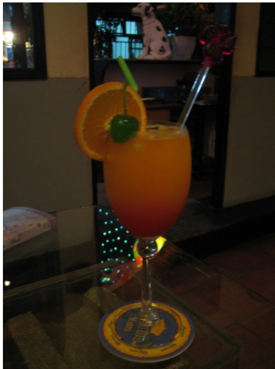
Figure 7.7 The 'Kuningtou Battle' kaoliang cocktail