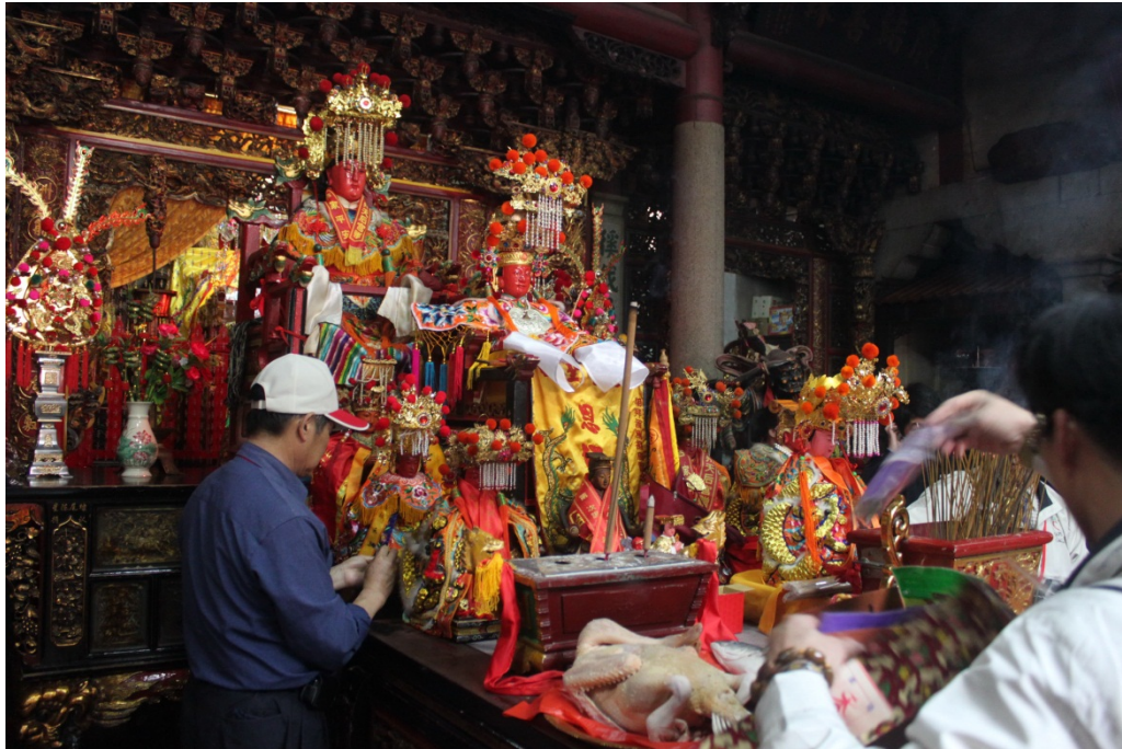
Figure 6.5 Mazu idols from different temples being assembled with the main idol in the Meizhou ancestral temple

sections will explicate the cultural-geo-politics of the Mazu pilgrimage and how this event creates spaces of the political within which the identities of Taiwanese pilgrims and that of their Chinese counterparts are being constructed and performed.