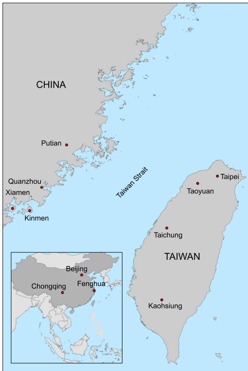
Figure 1.1 Map showing China and Taiwan, and location of places mentioned in the thesis

shows the location of places mentioned in the thesis. Kinmen, being physically nearer to mainland China became a military stronghold for the KMT (see Chapter 7). The People's Republic of China (PRC) that was formed on mainland China since 1949 has always regarded Taiwan as part of its territory. The ROC on Taiwan, however, sees itself as an independent country. This led to hostile relations between the two republics, with the PRC threatening to use military force if necessary.