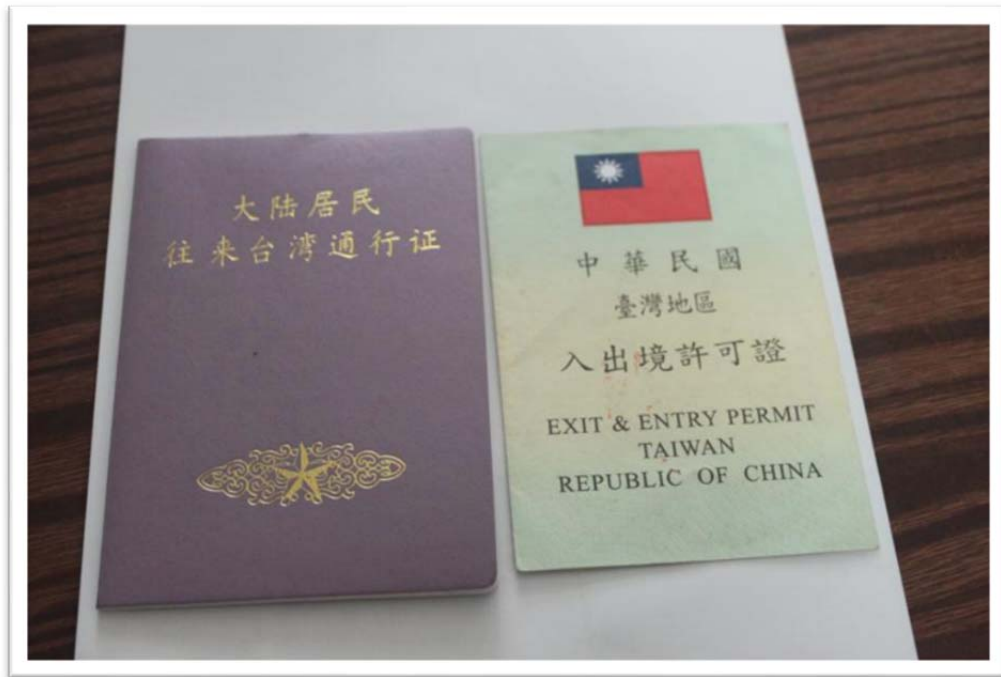
Figure 5.2 The permit for mainland China residents travelling to Taiwan (issued by the Chinese authority) and the Taiwan Travel Permit (issued by the Taiwanese authority)

A 'strange' way of management and control indeed, but the unequal treatment received by the conference delegates just goes to show that "relations between different passports are hierarchical and that they are experienced as such" (Jansen, 2009: 817). Although "identification is not reducible to identity" (Butler et al., 2000, cited in Amoore, 2006: 344), identity is still essentially not just about self-recognition, but also recognition by others (Beger and Luckman, 1967; Calhoun, 1994, cited in Wang, 2004). Apparently, the trustworthiness of a person is determined by the type of passport/permit s/he is issued with. I could sense Shen's feeling of injustice during the interview, but he had kept his response in a rather 'politically correct' manner by describing the entire saga as merely 'strange'. However, we shouldn't trivialise his affective material moments with the Taiwan travel permit when he questioned the authority of the organisers to detain such a "thing of ... personal identity" and