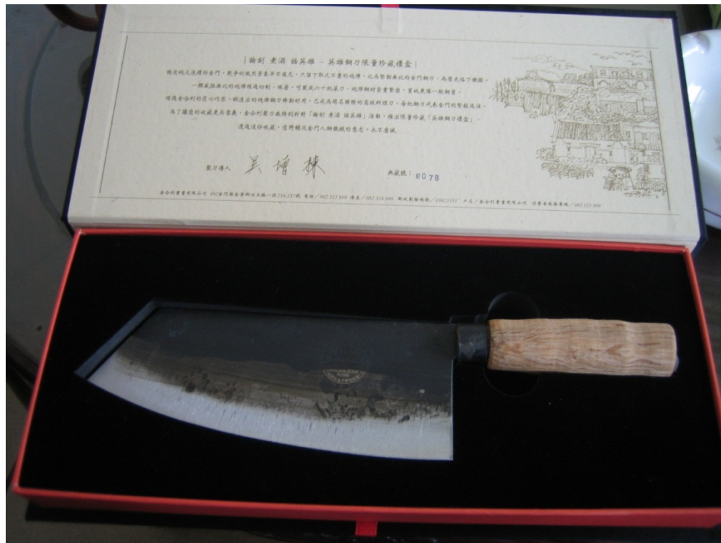
Figure 7.2 The Kinmen Knife

2011), not to mention the civil war between China and Taiwan. In the case of Kinmen, I suggest that the recycling of the past and perpetuation of memory can be materialised through the Kinmen Knife (Figure 7.2).