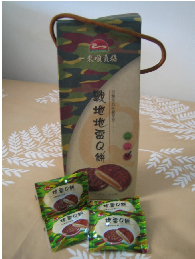
Figure 7.8 The Battlefield Mine Cake

Individually packed in sachets with camouflage design to accentuate the battlefield theme, these chocolate-coated cakes have fillings that come in a variety of different flavours ranging from kaoliang to strawberry and peanut. The sprouting of locally produced products that are associated with Kinmen's battlefield heritage is telling of the generative effects of tourism landscape governance. However following Taipei's friendly stance towards Beijing and the increased economic exchanges across the Taiwan Strait, local entrepreneurs with battlefield-related products to offer are beginning to set their sights not just on the Chinese tourists visiting Kinmen, but at the larger Chinese market on mainland China. As such, the increased sensitivity