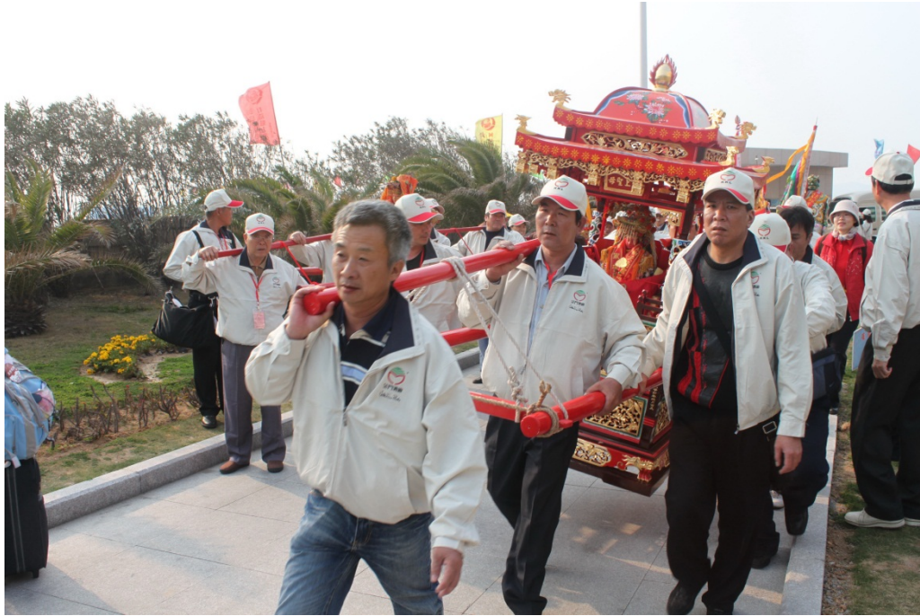
Figure 6.7 Pilgrims carrying their Mazu idol in her sedan chair