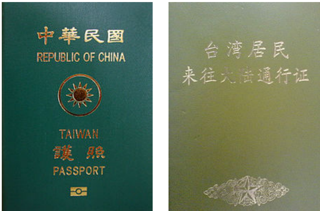
Figure 5.1 The Taiwan Passport (left) and the Taiwan Compatriot Permit

the Republic of China. The TCP is created by the Chinese Ministry of Public Security 18 and has been in existence since 1987 when the then Taiwan President, Chiang Ching-kuo lifted the travel ban across the Taiwan Strait. A typical Taiwanese crossing the border to mainland China would use the Taiwan passport at the Taiwanese checkpoint, and present the TCP to the Chinese authorities upon arrival in mainland China. Stamping on such a document thus allows both sides to temporarily avoid the sensitive issue of state sovereignty, on paper at least. In practice, this is not the case. A TCP holder is identified as someone who resides in Taiwan, but who is essentially a fellow countryman hence 'compatriot'. I am interested in how the possession of the TCP affectively interacts with the Taiwanese tourist at the checkpoint and how the checkpoint itself creates a liminal environment between home and away.