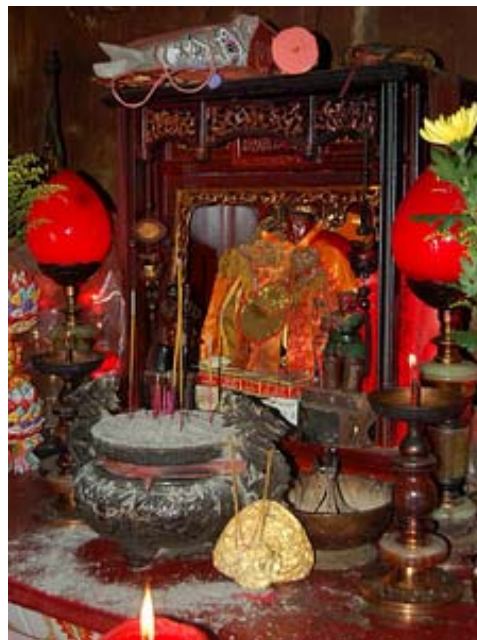
Figure 6.1 Façade of the Chaste Maiden Temple (top) and the deified Wang Yulan