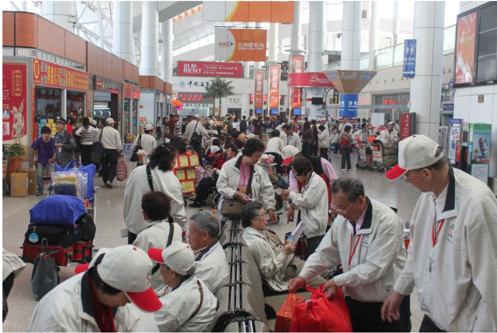
Figure 5.4 Taiwanese tourists at the waiting lounge of the Dong Du Ferry Terminal

During my fieldwork in China and Taiwan, I was quite often based in the Taiwan-held island of Kinmen. Although not the political centre of Taiwan, this island, which is situated in between the two 'Chinas', is very much at the heart of cross-strait politics. Even before the commencement of direct flights between China and Taiwan, Kinmen has been used as a test bed for re-establishing links between people from both sides since the early 1990s. What was called the 'mini-three links' 22 saw daily ferry services ply between Kinmen and the coastal city of Xiamen in mainland China. I often took advantage of the ferry service to travel between China and Taiwan as it only takes an hour and cost substantially less than a flight from Taipei. It did not take me long to realise that once the Taiwanese tourists reached the Xiamen ferry terminal, they would be approached by locals asking if they have any duty-free cigarettes or liquor to sell. These locals are often attendants from souvenir shops in the ferry terminal.