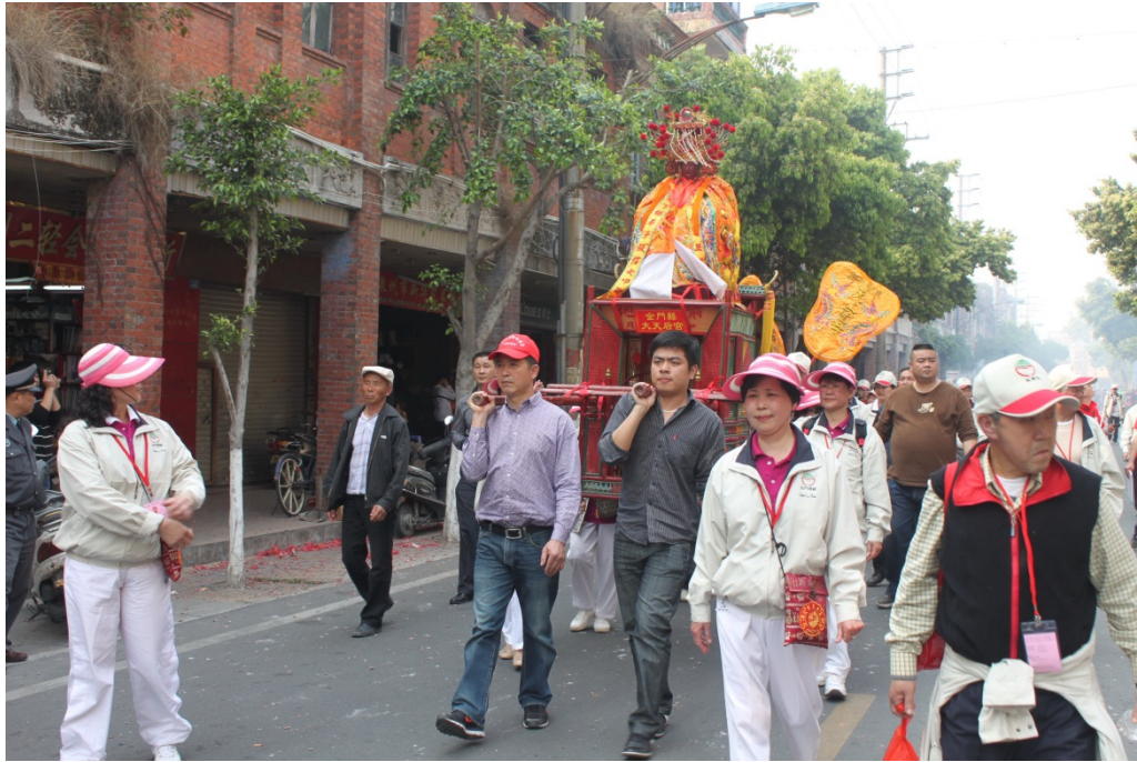
Figure 6.8 Taiwanese pilgrims processing past shop-houses in Quanzhou, China

Due to its more elaborated style, and the sheer number of its participants, a Taiwanese procession is often greeted by local devotees who will line both sides of the streets and look in awe at the spectacle. Some even set up tables of food offerings outside their homes/shops in anticipation of the passing procession and burn incense to welcome the numerous 'Taiwanese Mazu' idols (Figure 6.9). Taiwanese pilgrims I communicated with expressed their pride as they processed past the local people, and highlighted that they managed to preserve the traditions of the Mazu cult better than their Chinese counterparts.