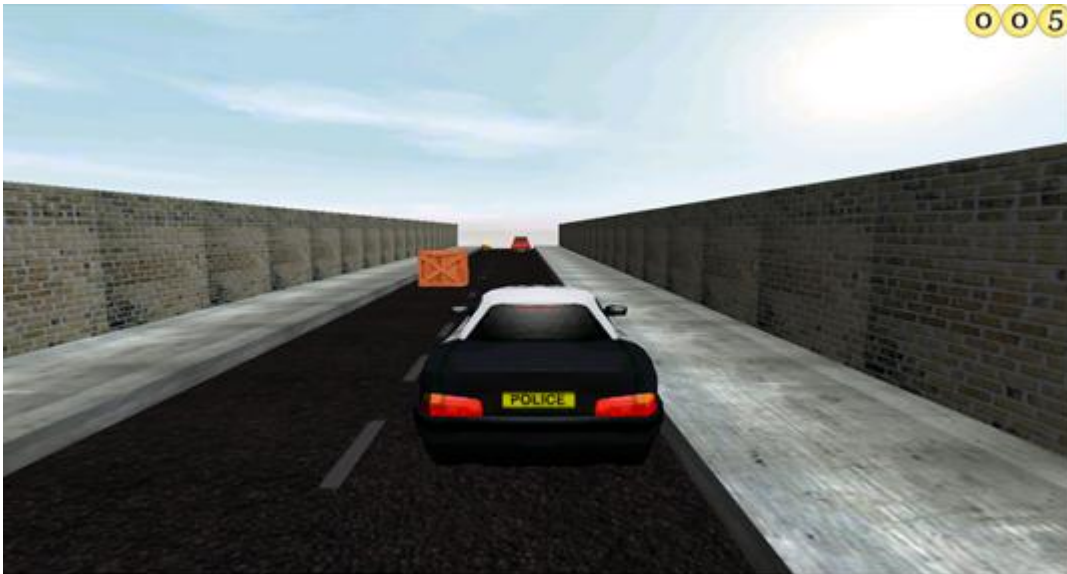
Figure 1: Illustration of the ongoing task