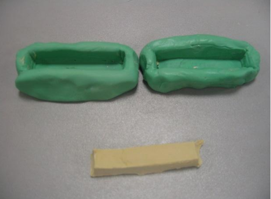
Figure 2 plaster block removed from mould