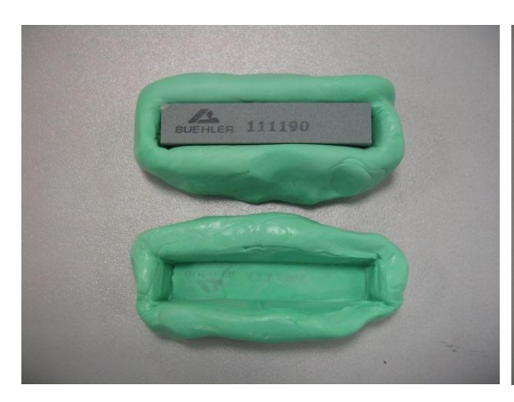
Figure 1 creating a mould using dental impression material