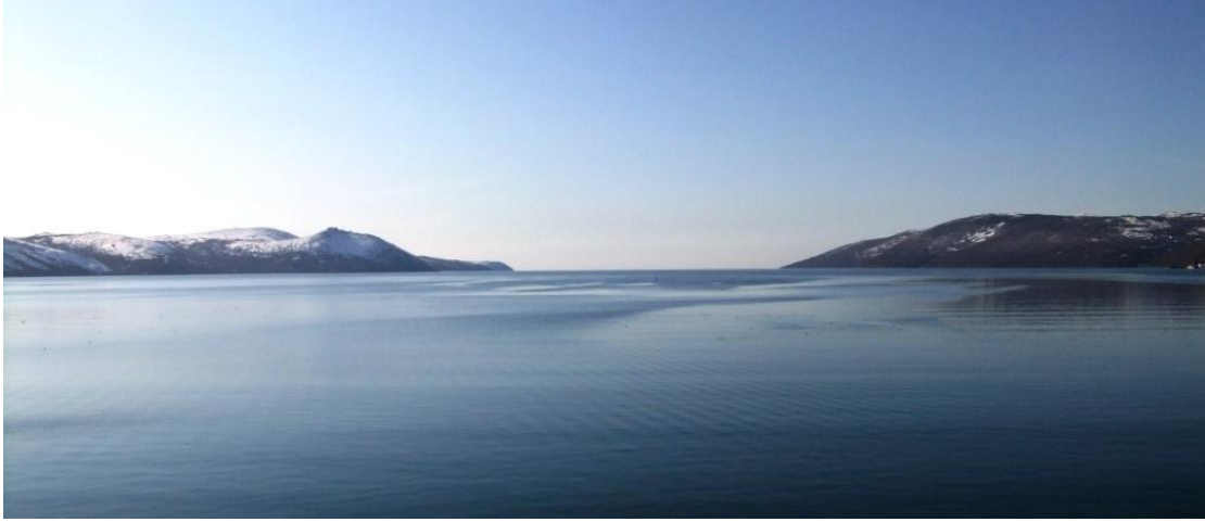
Nagaev Bay in Magadan