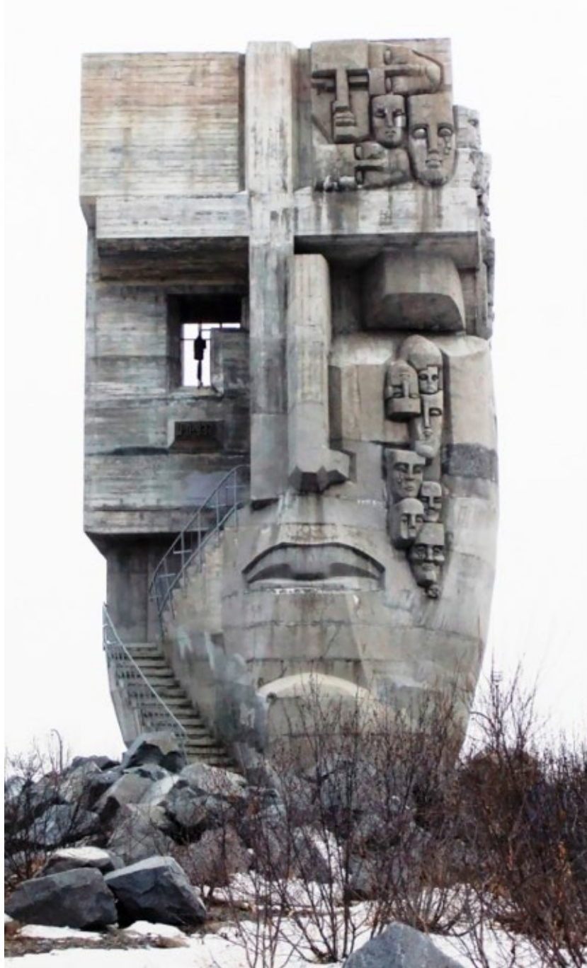
Mask of Sorrow