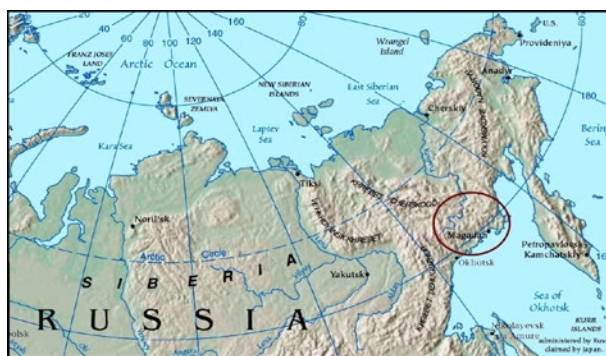
The Russian Northeast, map section from U.S.S.R. - Terrain and Transportation, 1974.

During the years of the Gulag Magadan functioned as the doorway to one of the most isolated and most dreaded punishment regions of the Soviet Union, according to Alexandr Solzhenitsyn, 'the greatest and most famous island in the Gulag Archipelago' (2003: xv). The Gulag functioned as a bureaucratic acronym for a special police department, created in 1929, that oversaw the administration of all corrective labour camps and labour settlements in the former Soviet Union ( Glavnoe Upravlenie Lagerei ). At the same time, the term 'Gulag' has also become synonymous with the entire system of excessive punishment and mass terror under the rule of Joseph Sta-