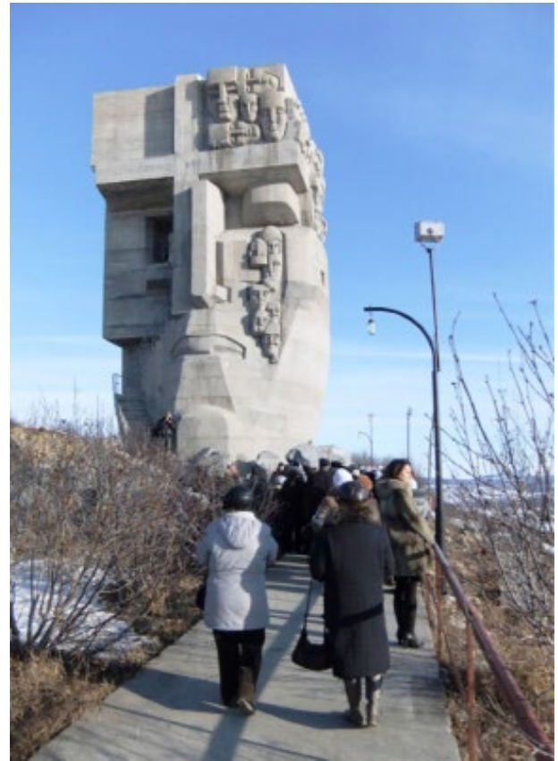
Remembrance Day of the Political Repressions in Magadan, 30 October 2011