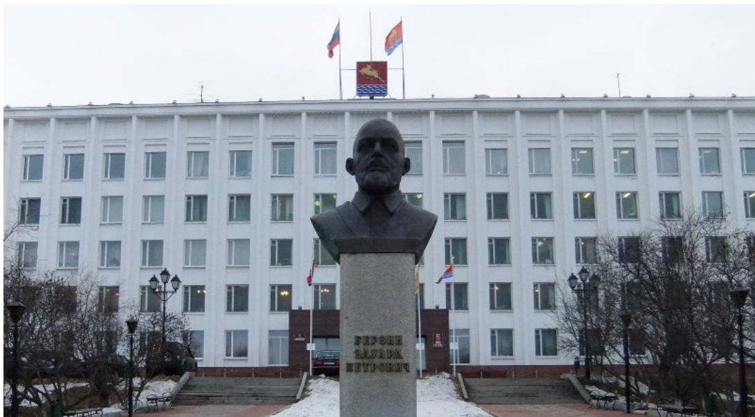
Berzin's bust in front of city admin