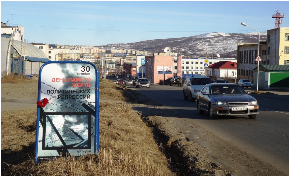
Marking the Road of Memory through Magadan on 30 October 2011