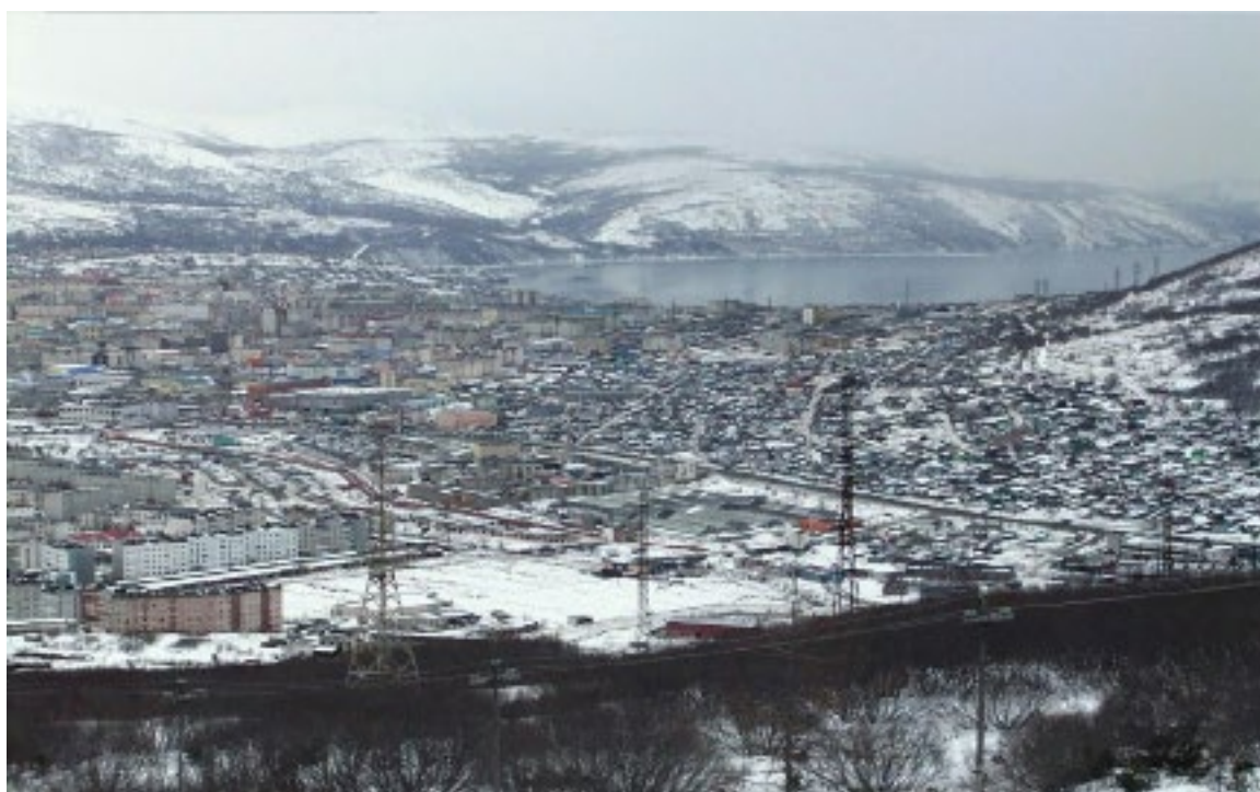
Magadan and Nagaiev Bay, Sep. 2011