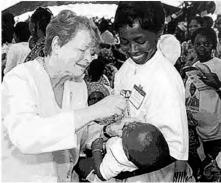
Figure 3: Dr Bruntland – current Director-General 12

revitalising the WHO, but what has happened to HFA2000? In Dr Bruntland's 16 page opening address in July 1998 she referred to HFA only once in reference to "keeping our long term objective of HFA..." 13 . She seems more interested in highlighting the importance of the special programmes especially relating to HIV/AIDS, which are more inclined to by-pass governments and be a "global initiative". WHO has to re-establish its two main roles; firstly to encourage governments and NGOs to work towards health for all, and secondly, to stress the need for partnerships between health and other sectors 3 .