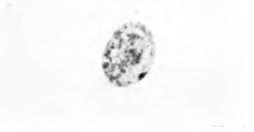
Fig. 3. Cell from the buccal mucosa of a normal female showing a single sex chromatin body (Barr body).

group 21-22 results in the profound disturbance of virtually every system in the body characteristic of mongolism. On the other hand the presence in an individual of an additional Y chromosome, which is of a comparable size, may be associated with no phenotypic abnormalities at all.