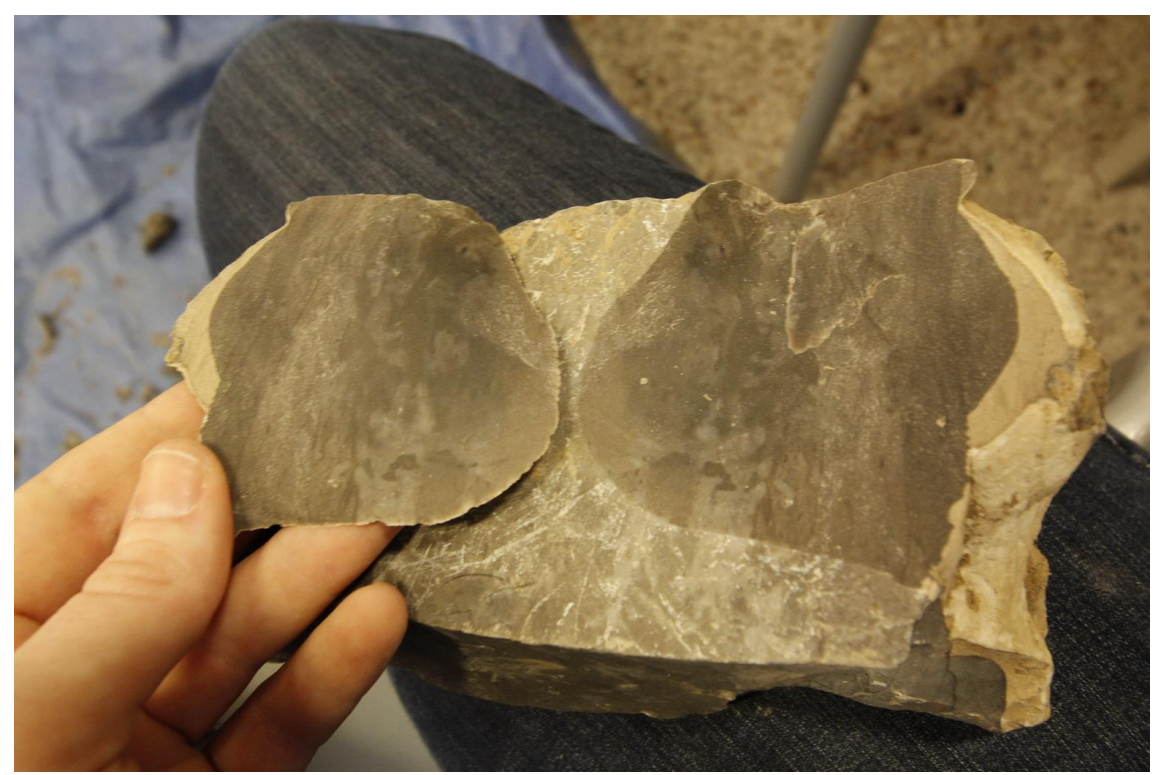
Figure 3. The chert gathered at the quarry made for fine knapping practice.