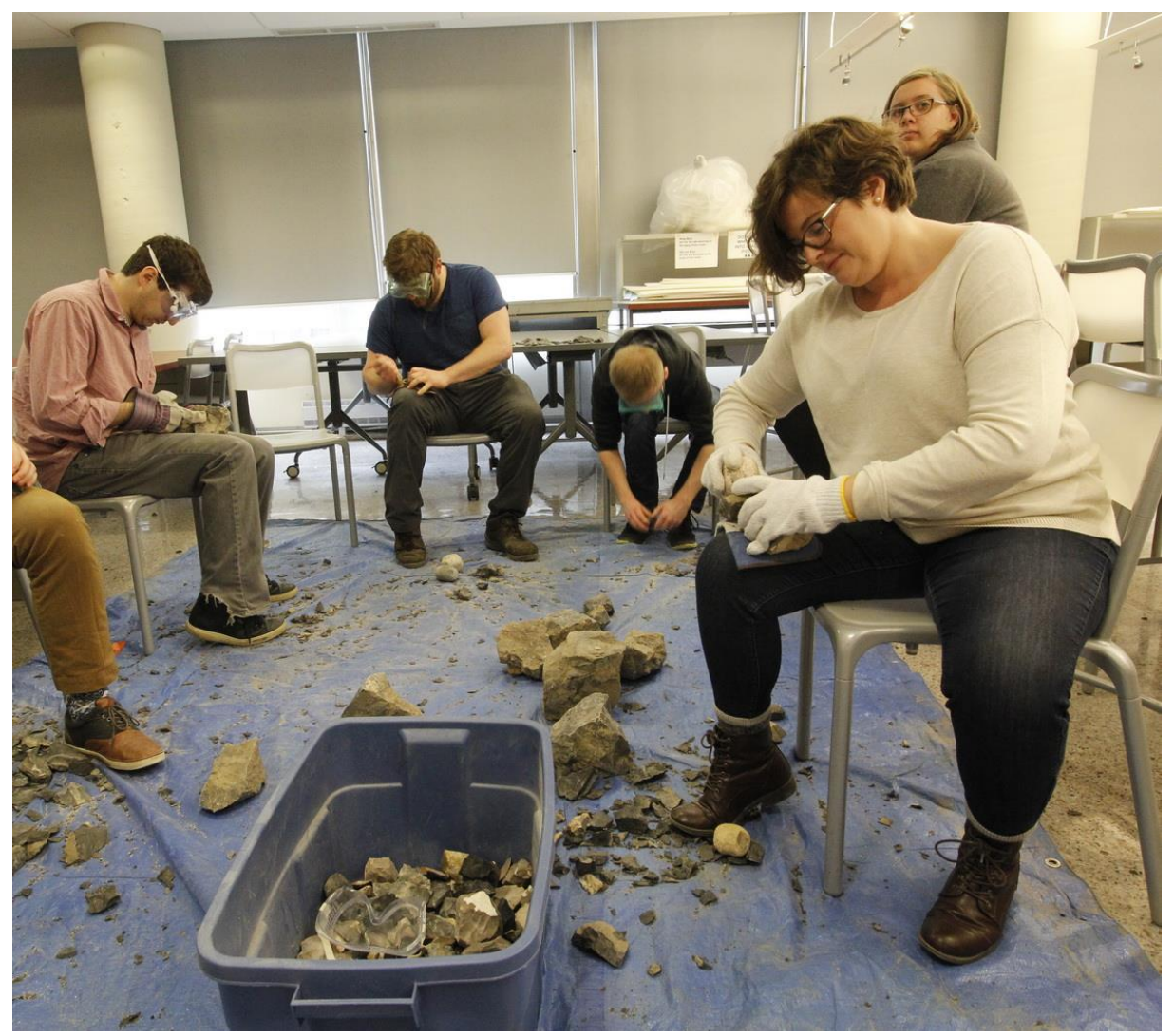
Figure 2. Knappers practice their skills on local Onondaga chert.

by the oily smell generated when knapping Onondaga. Despite the prevalence for fractures in the chert caused by the industrial equipment's high-energy handling of the deposit, the participants deftly managed to knap a generous collection of stout stone tools (Figure 3). Some students used antler and copper pressure flakers to create unifacial scraping tools from the flake assemblage at hand. This collection of flakes and unifacial tools created the bulk of the assemblage brought to the food processing activity that followed.