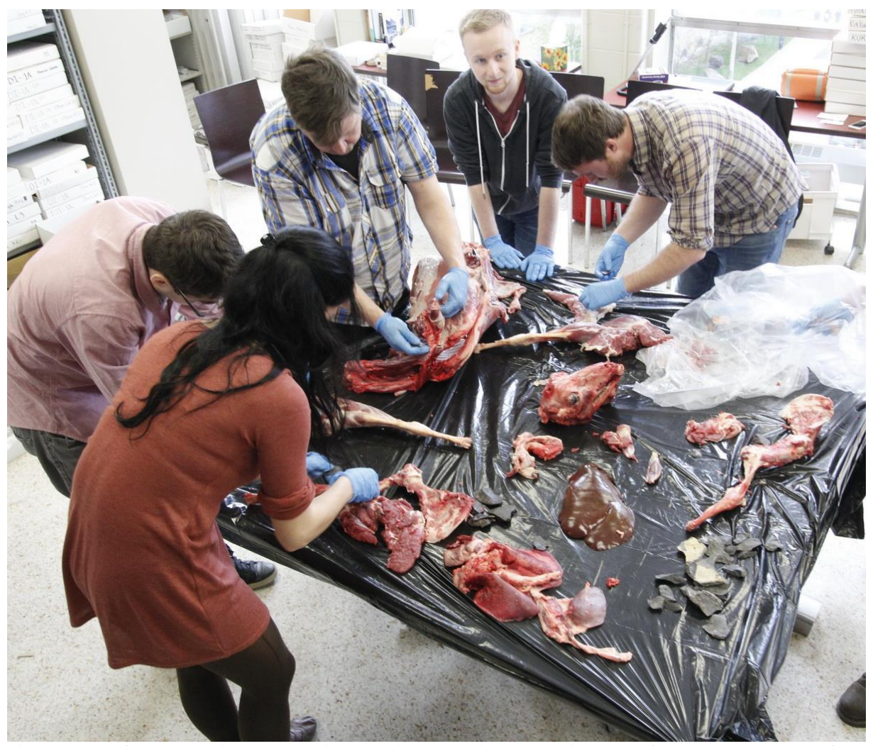
Figure 5. The food processing team sectioned and butchered the sheep in only a few hours. Each part of the animal was retained for food or a research project.

One of the Lithics Interest Group's goals is to give participants practical, hands-on experience crafting on and with lithic raw materials and tools. The stone tool experience described here was designed to fulfil that goal and frame the theoretical classroom-based discussions that the group organizes throughout the year. The group also used the experience to debate some of the ways education and communication can facilitate stone tool production and use.