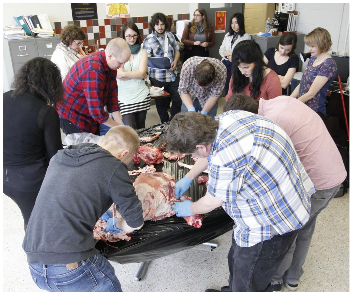
Figure 4. Participants butcher the sheep as colleagues observe the process.