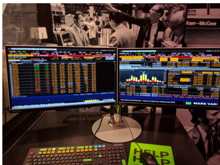
Figure 1. The current Bloomberg Terminal in a dual-screen configuration.

The Bloomberg Terminal, or more accurately, the online data and information services marketed under the banner of Bloomberg Professional, made its initial appearance in December 1982, and has become an enduring, even iconic, tool in the history of computing, to the extent that various models appear in Silicon Valley’s Computer History Museum and in the Smithsonian’s National Museum of American History (McCracken, 2015).