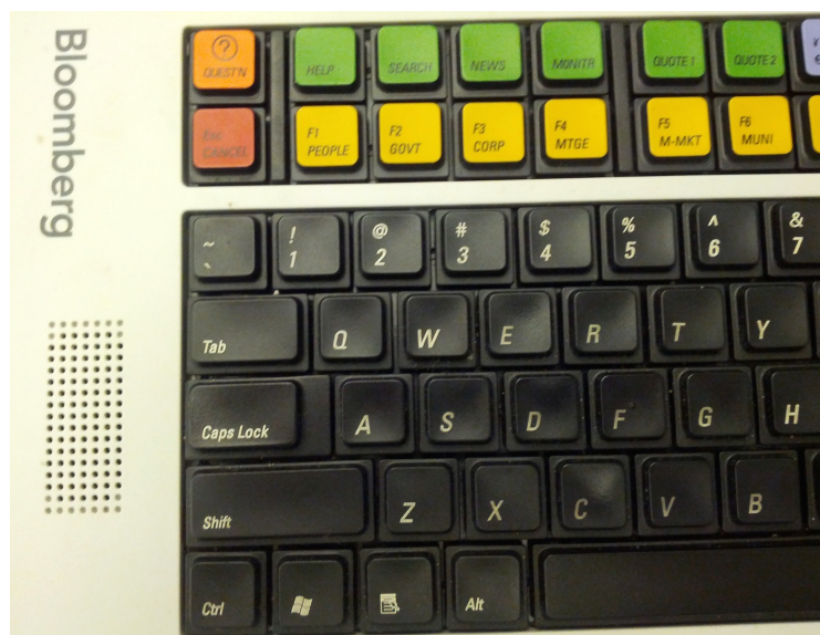
Figure 2. The Bloomberg Terminal keyboard.

The Bloomberg Professional service can be accessed through PCs, tablets, and smartphones, though its most iconic manifestation is through the Bloomberg Terminal, a dual-screen monitor with a fingerprint scanner and specialised, colour-coded keyboard that offers immediate access to areas such as EQUITY, NEWS, COMMODITY, CORP and GOVT. Although art investment has become an important asset class, there is no direct ART key.