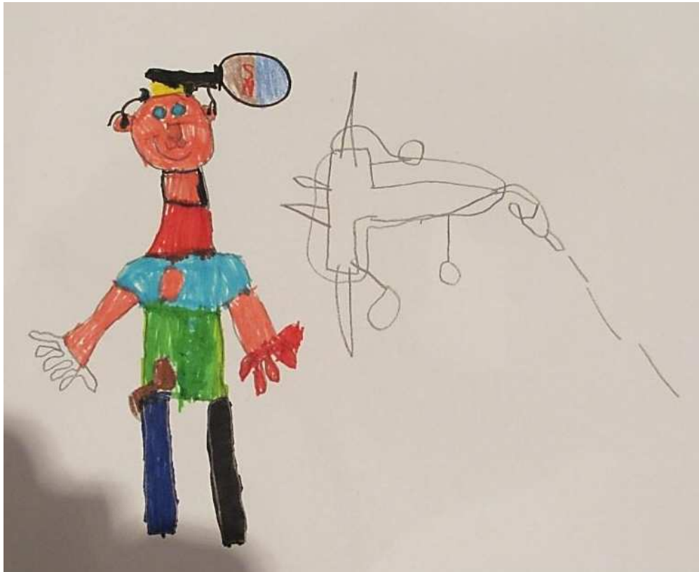
Figure 1: Andrew's self-portrait