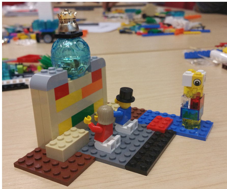
Figure 2. Economic incentives.

“[P]eople [are] always looking forward and looking up to what is the financial ideal, what is the market, or what can we patent, what can we get money for? Whereas the strange animal that is academic and socially valuable research is left in the corner”.