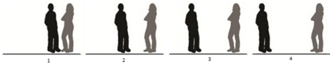
Figure 2. Interaction distance images.

The second section of the questionnaire addressed the following themes (one question per theme):