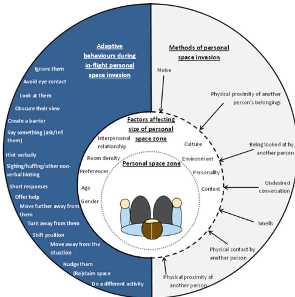
Figure 4. Factors affecting personal space and adaptive behaviours during in-flight personal space invasion.

that retrospective recall of flight experiences was insufficient to elicit the impact of largely subconscious proxemics issues and behaviours, particularly out of context (Ahmadpour, Robert, and Lindgaard 2016). A later survey conducted in-flight, found that proxemic concerns such as privacy and control were associated with the passenger attitudes avoidance and adjust respectively (Ahmadpour et al. 2016). The authors concluded that consideration of these attitudes in the design of seats and allocated passenger space can increase comfort. The current study specifically examined passenger responses to personal space invasion by others in the aircraft cabin environment.