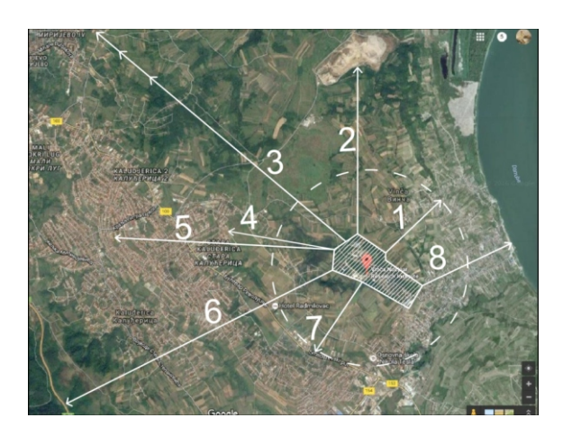
Figure 1. Location of the Vinča Institute of Nuclear Sciences and facilities in its closer surroundings 1 – protection zone 1500 m, 2 - 2.2 km from city dump, 3 - 14.0 km from city of Belgrade, 4 - 2.0 km from settlement, 5 - 3.5km from settlement Kaludjerica, 6 - 4.5 km from highway road, 7 - 1.2 km from regional road, 8 - 1.5 km from significant archeological site and river Danube

The Spatial Plan of the Republic of Serbia from 2010 [18] (with the Environmental Impact Assessment Report) provides basic indications regarding nuclear energy and safety, i. e. the trans-border monitoring. It mentions that systematic geological explorations of nuclear minerals (uranium and thorium) were discontinued, primarily because of the moratorium that prohibits the new construction of nuclear power plants until 2015. The reserves are mainly linked to certain