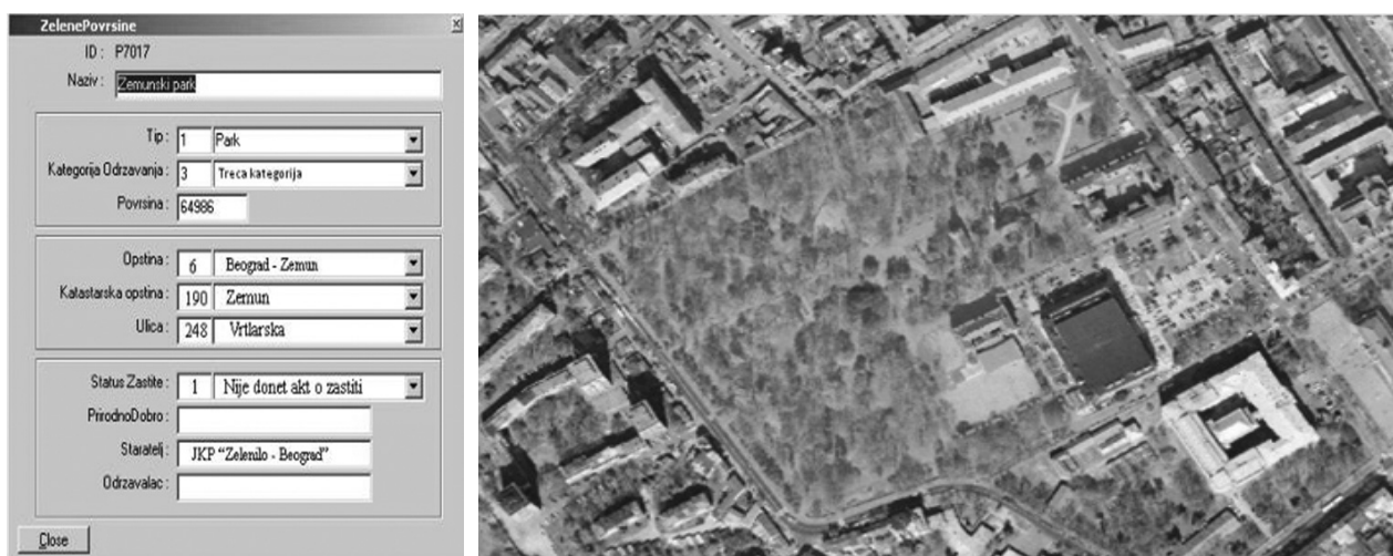
Figure 2. Defining boundaries and attribute values of green areas:

The GIS of Belgrade GA, covering about 3,000 hectares of public green areas of different types, is in its final phase of implementation. It will be a significant information base for the development of the strategy for climate change adaptation and in the creation of a climate-smart and green city of Belgrade. Overlapping the green area maps of the GIS GA with temperature maps and maps of the catchment areas of the city will enable the proper distribution of green