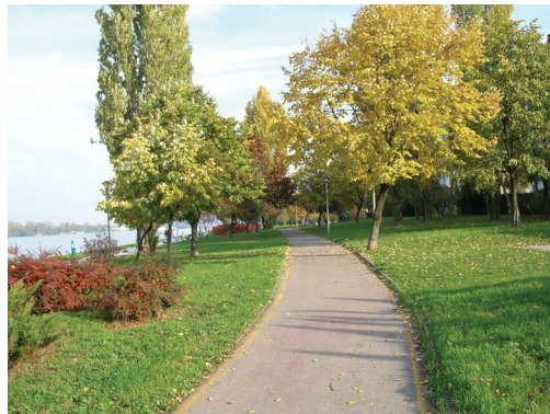
Fig. 5. Residential park by the river Danube

technical measures of prevention or to reinforce police supervision. The general conclusion is that the residents and the visitors of Belgrade still feel relatively safe in urban public spaces. They feel the safest in the areas that are "alive", frequented and well illuminated at night, or in some manner monitored, and they feel insecure near the areas with a large circulation of people or the presence of "risky groups" or in the spacious park spaces where there is not enough visitors. The feeling of insecurity is equally caused both by spatial elements and by the presence of "unwanted persons", and the majority of citizens believe that there is interdependence, i.e. the spaces that are under-equipped and used to attract offenders or other persons who inspire fear (listed as: homeless, alcoholics, drug addicts, etc), which makes the space dangerous and undesirable, i.e. leads to the fact that it causes fear and people avoid it whenever possible.