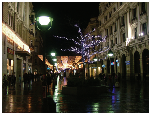
Fig. 1. Pedestrian zone of Knez Mihailova Street by night, with decorative lighting