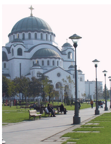
Fig. 7. Renewed public places: coherence with urban safety, St Sava church in Vračar.

Analyzing the condition in Belgrade, based on the information gathered, including also the opinions of direct users it have been concluded that Belgrade is still a relatively safe city but also that measures should be taken which would contribute to the feeling of safety to still remain. The recommendations for further actions were certainly creation of the unique database in GIS technology, which could provide process monitoring in space, mapping of events and actions, registering of changes, making comparative analyses and analyzing the results of the application of positive measures of prevention. Education and specialization of experts in these topics is preferable equally as general awareness of the citizens and their elected leaders. Considering that legal framework provides the possibility of application of urban-architectural measures of prevention, it is necessary to work on their standardization and creating by-laws or running professional publications.