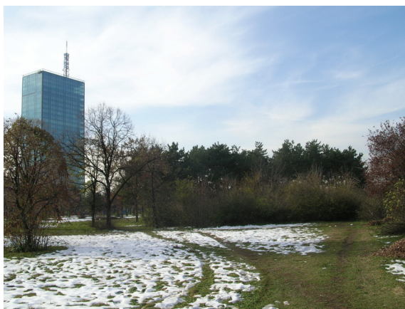
Fig. 2. Urban park on Ušće, New Belgrade