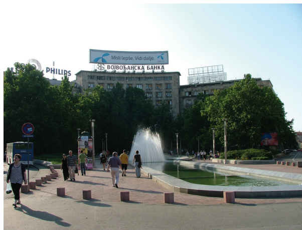
Fig. 6. Frequent use of public place, Square of Nikola Pašić

The principle of accessibility is based on the same humanistic concepts and legal provisions guaranteeing equal rights for all citizens to freedom and which prohibit discrimination and exclusion on any grounds. The freedom of movement, the feeling of comfort include also the feeling of security and safety, and most of the measures, including also the technical ones, contribute to a different appearance, understanding, acceptance and manner of space usage. The concern about the public spaces, but also the concerns about all members of society, providing equal opportunities to all through the measures of adjustment, sharing space and enjoying life together, communication and a sense of belonging are the basis for creating a secure and safe environment. If the needs of the most vulnerable sections of society have been met (e.g. people with disabilities, the elderly, children or women), then the needs of all those who do not feel vulnerable or endangered will also be met, but they can easily become the same (vulnerable and endangered) if they are exposed to the inconvenience of a neglected and hostile environment.