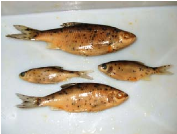
Figure 2. Infected roach from the Modrac reservoir

Similar studies of parasites in fish from the Modrac reservoir (Skenderović et al., 2005) included testing on the presence of endoparasite Trianophorus nodulosus , where it was noted that the mentioned endoparasite was present only in the species Esox lucius . Shukerova (2004), in Carassius gibelio in the area of Bulgaria, identified the presence of two trematodes and two nematodes characteristic for this species. According to Rukavina (1959), the harmful activity of Cestoda , Cyathocephalus truncates on more strongly attacked trout manifests in a reduced vitality and a significant negative impact on the fullness and weight of fish.