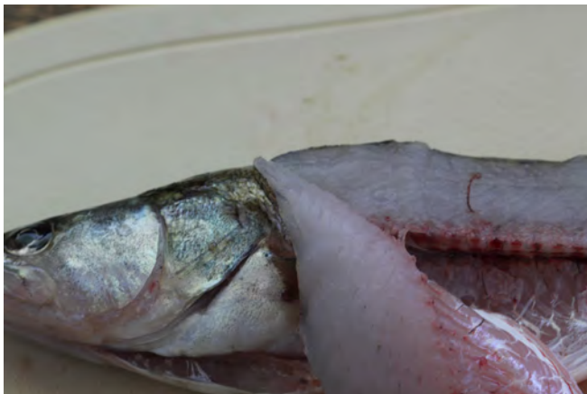
Figure 2. Eustrongylides sp. in the muscle of European catfish ( Siluris glanis )