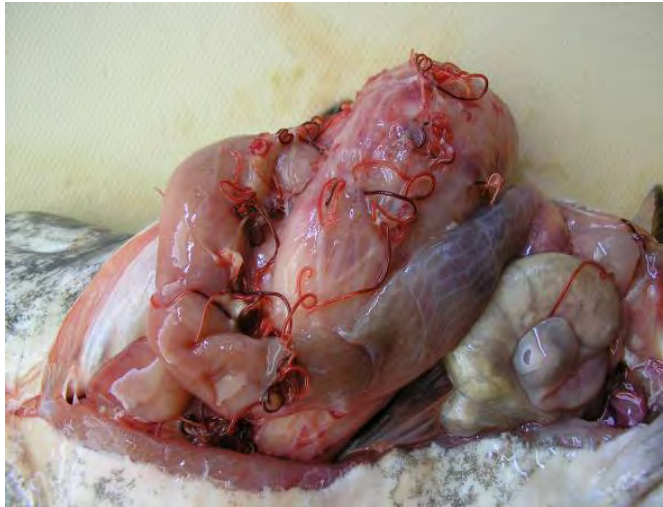
Figure 1. Eustrongylides sp. in the abdominal cavity of European catfish ( Siluris glanis )

Presence of nematodes in the abdominal cavity (Figure 1), musculature (Figure 2), in the lumen of the stomach and encapsulated in stomach wall was revealed in 4 individuals of zander and 6 individuals of European catfish, what represented the prevalence of 14.26%, respectively 11.54%. The number of parasites per fish ranged from a few up to the 256. Parasites were determined as Eustrongylides sp. - larval form. This larva, was robust and pinkish red. Length of body was 27 – 60.5 mm, maximum width 0.49 – 0.58 mm. Buccal cavity 0.09 – 0.11 mm, oesophagus 0.907 – 1.35 mm. The larva retained a cuticle, and its twelve visible circle cephalic papillae were well defined. The number of papillae appeared to be six in each of two circles. The number of papillae was confirmed by apical observation with light microscopy. Inner circle papillae were spine-like apices and those of the outer circle were nipple-like apices. Pathological observation of stomach and muscles are presented in Figure 3 and 4.