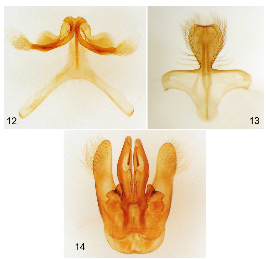
Figures 12–14. Male terminalia of Ptiloglossa cyaniventris Friese from Panama. 12. Metasomal sternum VII. 13. Metasomal sternum VIII. 14. Ventral view of genital capsule.

po 23 km E, Carti Rd., 20 June 1982, D. Roubik, No. 50 (DZUP). 1♂, Panama Prov., 14 Km W. El Llano (Carti Rd. Km 9), 22 April 1981, on Psychotria sp., R.W. Brooks (SEMC). 2♂♂, Panama Prov., 15 Km N. El Llano (Carti Rd.), 10 May 1981, on Psychotria sp., R.W. Brooks (SEMC). Costa Rica: 1♂, Finca la Tirimbina, La Virgen de Sarapiqui. 9/06/1997 (Trat: B/LR, Parcela: 9, COLCTA: so 65-3, spa: 3/3) (INBIO).