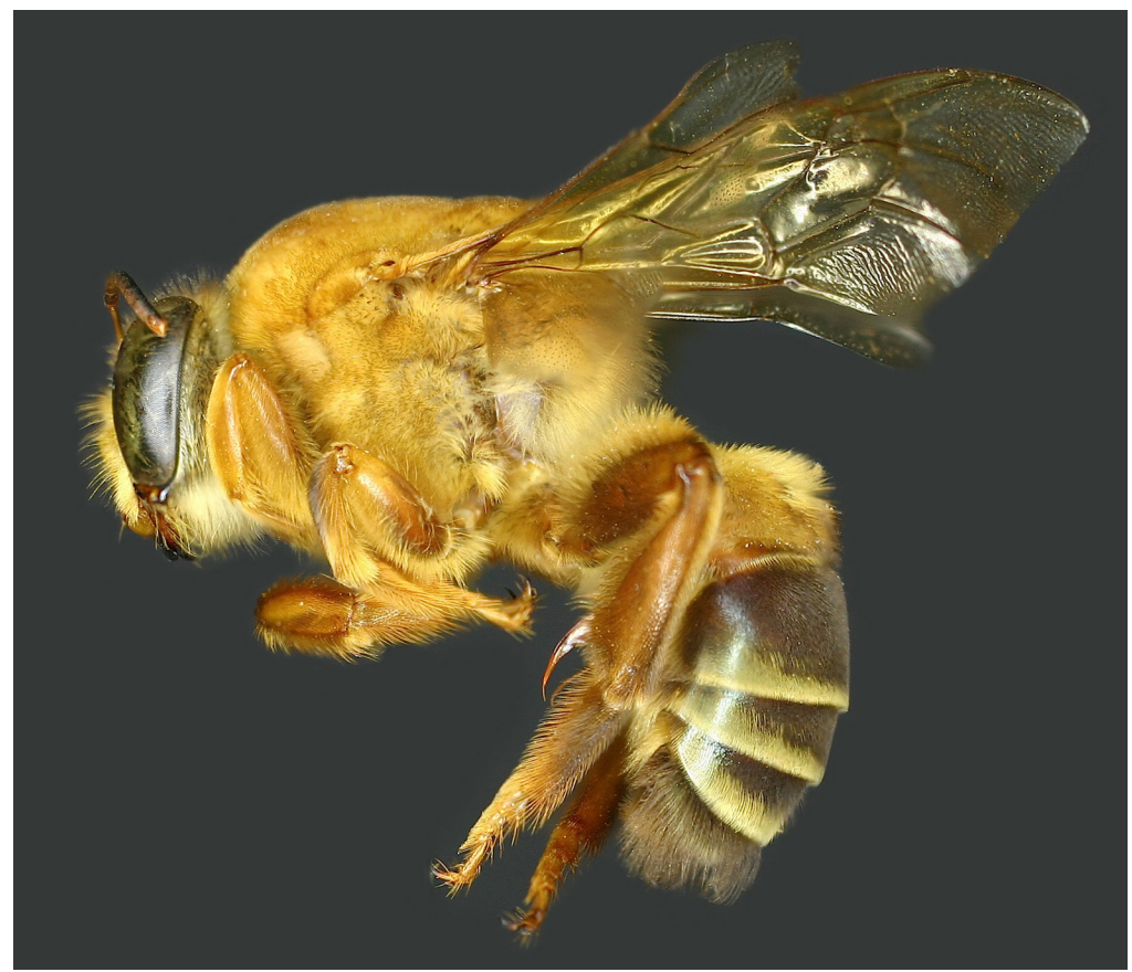
Figure 1. Lateral photograph of male of Ptiloglossa chamelensis , new species, from Mexico.

idad, Santo Domingo de Heredia, Costa Rica. In total 36 specimens, 16 females and 20 males, were examined for the two species reported.