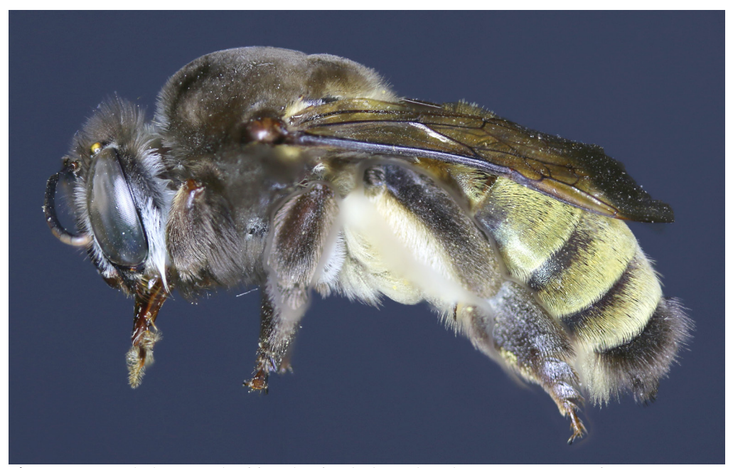
Figure 8. Lateral photograph of female of Ptiloglossa chamelensis , new species, from Mexico.

ally with setae shorter and slightly more sparse. Tegula yellowish brown, translucent. Wing membranes hyaline, slightly tinged color of parchment; veins brown to dark brown. Legs with fulvous to brown integument; fore- and midlegs with yellowish brown pubescence; mesofemur with darker integument in basal half; metafemur with dark brown setae on outer surface, with paler setae towards posterior; mesotibia with dark setae on outer and posterior surfaces, inner anterior margin with yellow setae; mesotibia gradually widened apically, maximal width at level of fushed outer metatibial spur (Fig. 4); outer metatibial spur broad and flattened proximally, then tapering quickly and apically projected (Fig. 4); wide space between base of spur and apical articulation of metatibia (Fig. 4); inner metatibial spur thin and longer than fused outer metatibial spur; metabasitarsus with dark setae on posterior margin, remainder of surface with reddish brown setae; metabasitarsus flattened, with a rounded angle along anterior margin near base (Fig. 4); remainder of metatarsomeres with integument and pubescence brown. Lateral surfaces of propodeum with long setae with darkened apices; basal area of propodeum very finely and faintly imbricate, shiny.