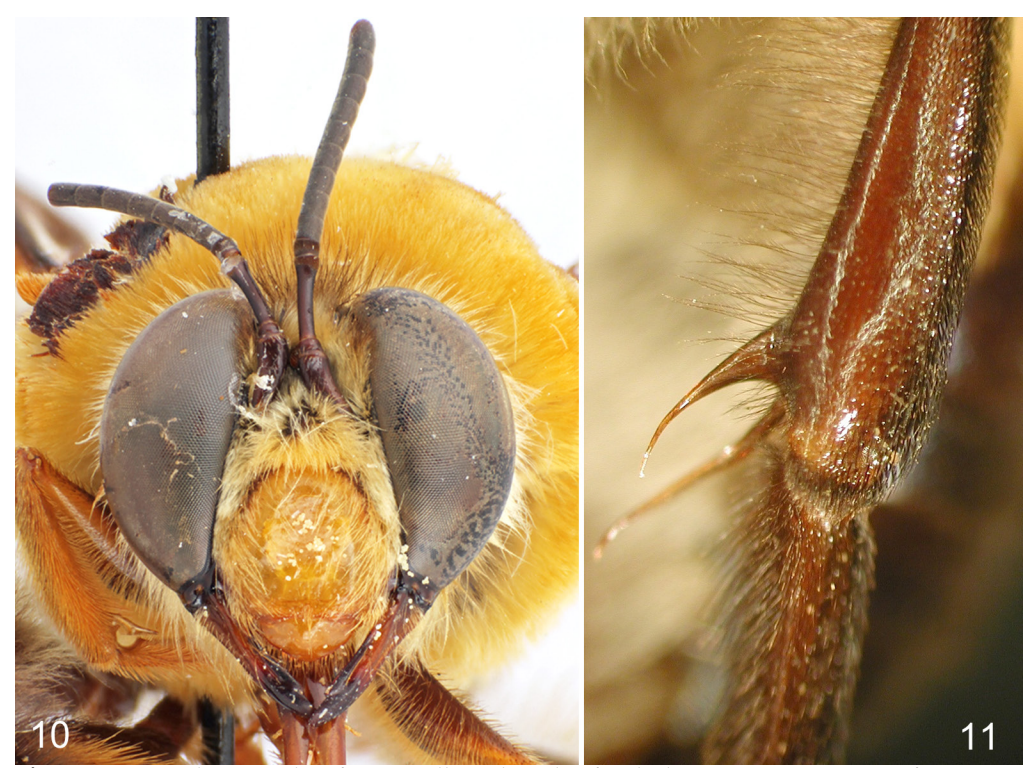
Figures 10–11. Photographs of more yellowish male of Ptiloglossa cyaniventris Friese from Panama. 10. Facial view. 11. Outer surface of metatibia.

with a abundant, fuscous, erect, plumose setae, such setae a little longer than width of metatibia; metabasitarsus with an anterior edge elevated along length, delimiting distinct, narrow anterior-facing surface from wider outer surface (itself distinct from the inner surface bearing the dense, thickened, stiff, apicall-directed, simple setae).