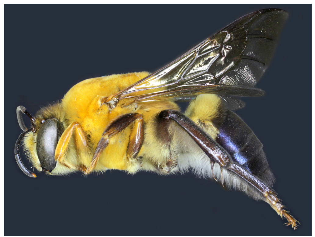
Figure 9. Lateral photograph of a more yellowish male of Ptiloglossa cyaniventris Friese from Panama.

projected, with discal area relatively flat to slightly depressed (Fig. 10). Compound eyes strongly converging above (Fig. 10). Ocellocular distance extremely short, similar to posterior interocellar distance, narrower than minimum width of first flagellomere; interocellar posterior distance shorter than an ocellar diameter. Vertex below upper tangent of compound eyes in facial view; ocelli situated below level of vertex in facial view. Occipital margin posterior to ocelli strongly depressed. Facial and genal pubescence yellow, setae of vertex fuscous, upper frons intermingled with yellow and fuscous setae.