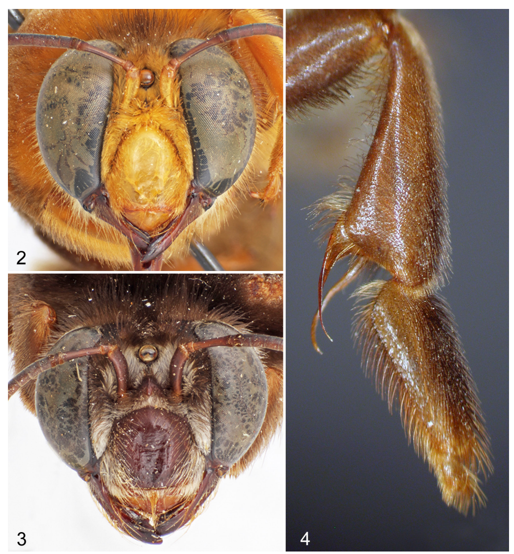
Figures 2–4. Photographs of Ptiloglossa chamelensis , new species, from Mexico. 2. Male facial view. 3. Female facial view. 4. Outer surface of metatibia and metabasitarsus.

moderately dense yellow pubescence (Fig. 8), integument with noticeable greenish highlights. Males can be recognized by the combination of a projected clypeus with the upper discal area prominent (Figs. 2); short ocellocular distance (Fig. 2), metatibia widest apically at level of fused spur; fused metatibial spur wide and flat proximally, then projecting apically (Fig. 4); and the metasomal terga with apical bands of yellow pubescence (Fig. 1).