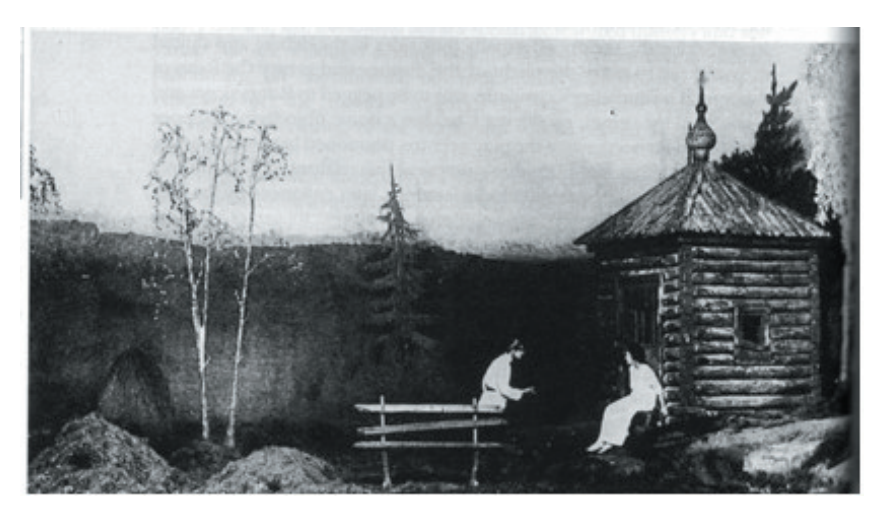
Figure 1. The set for Act Two of The Cherry Orchard, Moscow Art Theatre, 1904.

Stanislavsky is not the only one guilty of negligence or misunderstanding here. Sometimes the possibility of our seeing that horizon is precluded by the translator. Among translations into English, David Mamet's and, surprisingly, Trevor Griffiths's versions of the play acknowledge neither the town nor the horizon.<sup>11</sup> Pam Gems notes the "outline of a town," but it is merely in "the distance," not