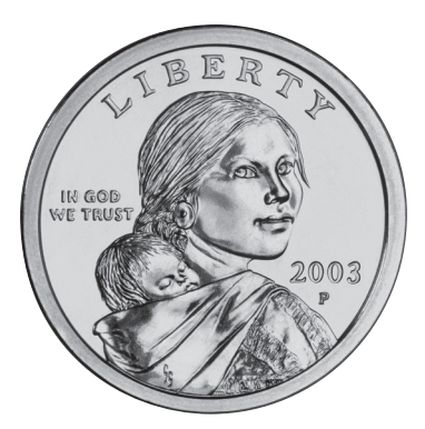
Figure 2: Golden Dollar Obverse © 1999 United States Mint. All Rights Reserved. Used with permission. United States Golden Dollar coin image courtesy United States Mint and used with permission.

of Sacagawea exists by anyone who actually saw her, visual artists have borrowed freely from preexisting iconographic traditions, most notably the Madonna and Child an adaptation deeply implicated within ideological structures concerning gender, race, and manifest destiny.<sup>5</sup> Sacagawea is rarely shown without the visual marker of her maternity—her infant son, Jean Baptiste, nicknamed Pomp. This baby has become her attribute, the sign that forces recognition and signifies that for which she is most honored and remembered.