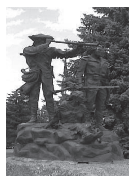
Figure 10: Robert Scriver, The Explorers at the Marias , 1975. Fort Benton, Montana.

more recent public monument depicting Sacagawea, Eugene Daub's Corps of Discovery (Figure 11), erected in Kansas City in April of 2000, we see this same hierarchical grouping. With one leg kneeling on and the other wrapped around the rock that signifies the western lands, this Sacagawea perches beneath the towering figure of Lewis. She is the most grounded of the figures forming the base of the compositional pyramid, Clark's slave York just slightly higher, but hidden behind Lewis's voluminous cape. In an attempt to be historically accurate, Daub adds a new visual attribute-a basket that alludes to her food gathering on the expedition and thus to her role as caretaker and nurturer, not only of baby Pomp but also of the men on the expedition.