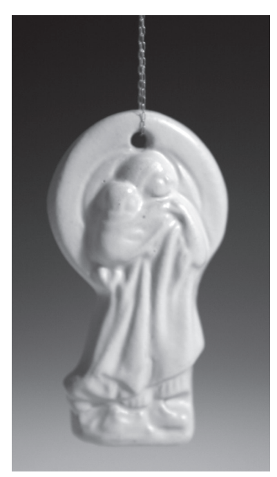
Figure 6: Sakakawea ceramic curtain pull/pendant, 1934. Issued by the North Dakota Federated Women's Clubs. University of North Dakota Pottery Collection. Photo: Donald Miller, February 18, 2009.

ramic curtain pulls/pendants made in 1934 for the fiftieth anniversary of the North Dakota Federated Women's Clubs (Figure 6). Although based on Crunelle's statue in terms of pose and dress, the white-glazed figurine includes a mandorla, a halo-like circle surrounding Mother and Child. Like a votive object, it is small enough to "be entirely grasped, enclosed, or comfortably operated by the human hand," a feature that allows the icon's "aura" to be possessed.<sup>36</sup> In addition, because this image is on a decorative object to be displayed in the home, the sanctification of motherhood extends to the domestic interior, the space within which these white middle-class clubwomen are to fulfill their patriotic duty, which is to bear and raise the next generation of Americans.