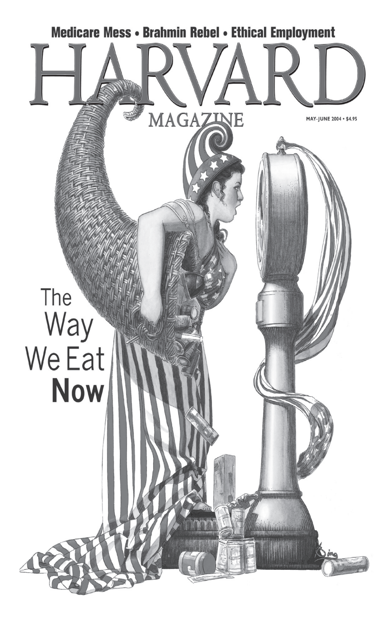
Figure 1: Obesity represented as a threat to the nation requiring the patriotic resolve of citizens.