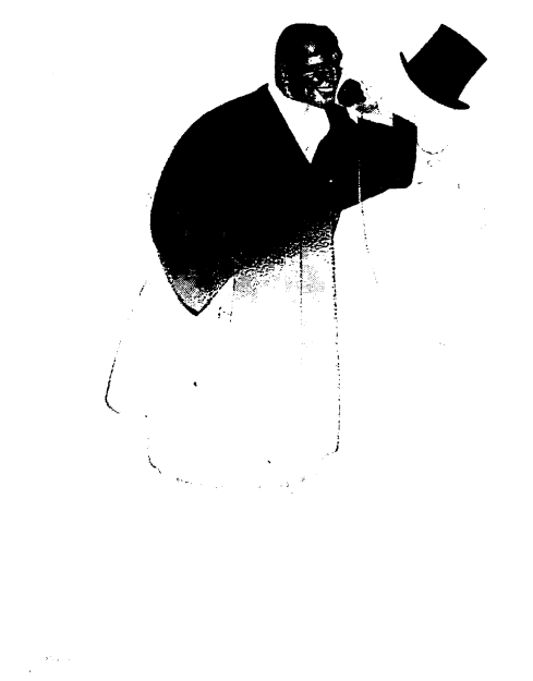
"But Com' you see tomorrow, today, I'm getting jurisdiction about the day after?"