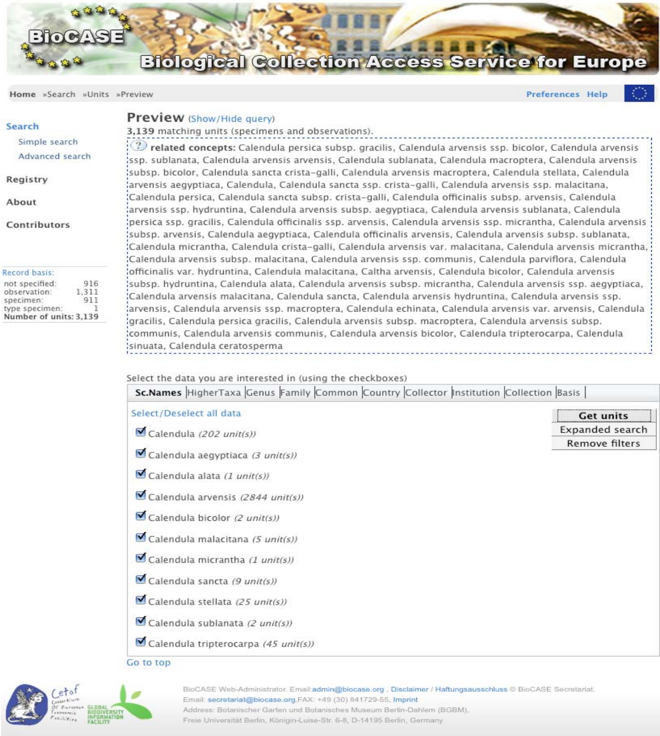
Figure 3. Query expansion for the term Calendula arvensis using TOQE in BioCASE. The original result set is increased from 2844 to 3139 records.